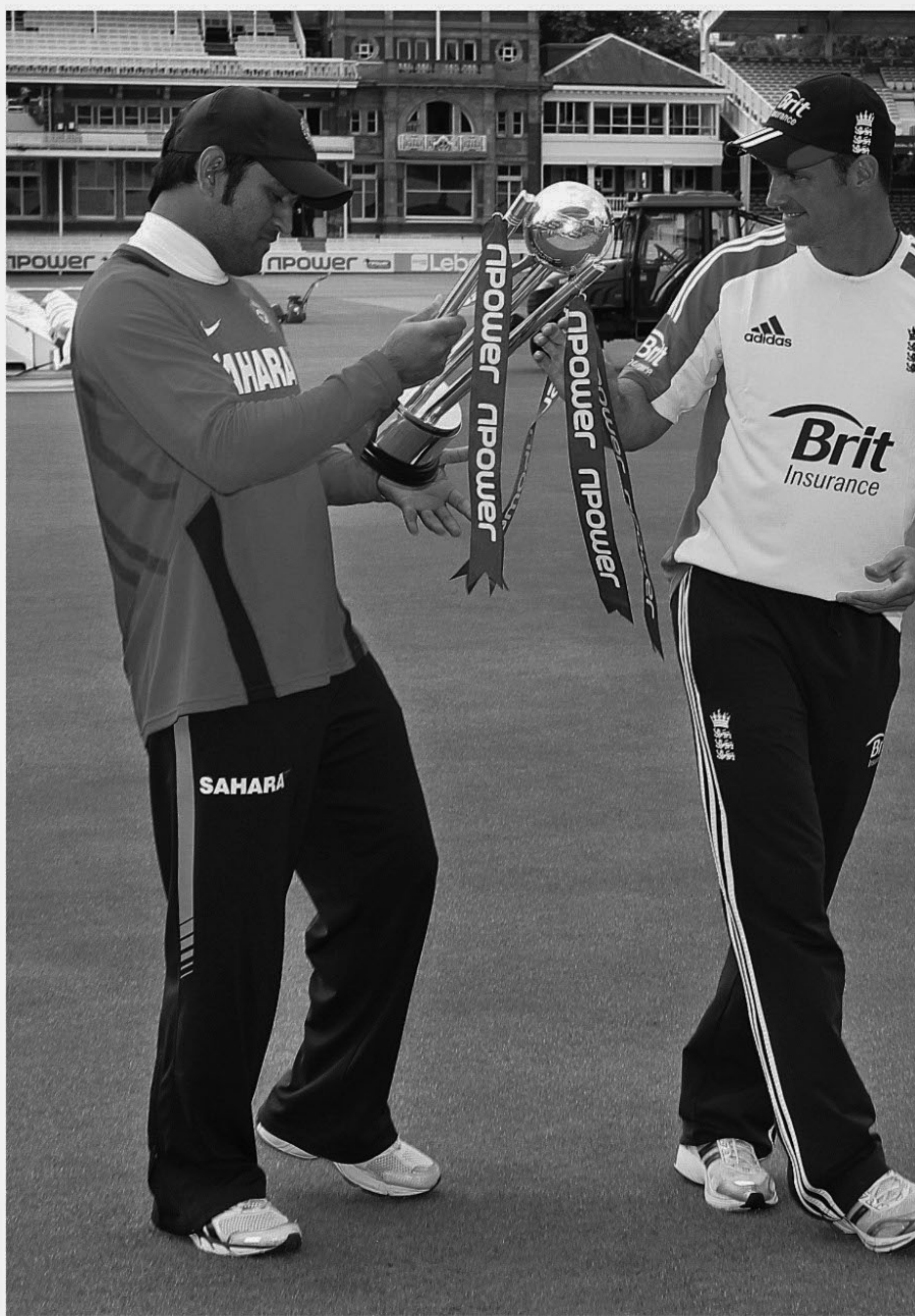
India captain Mahendra Singh Dhoni (L) and his England counterpart Andrew Strauss share a light moment as both have their hands on the Pataudi Trophy after a photo session at Lord's yesterday.

"There are some norms and everybody should maintain it. You can even express your anger in a decent way. What I want to say that he was not wise in his comments. So we will look into the matter," he added.