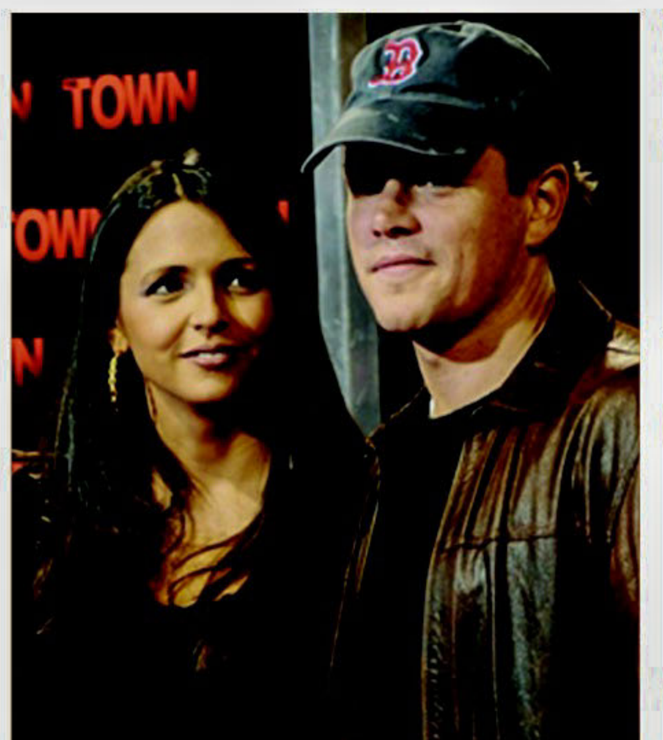
Matt Damon and his wife, Luciana Barroso (left) and Brad Pitt with Angelina Jolie.

It's no secret that Matt Damon keeps company with some pretty famous friends -- Ben Affleck, George Clooney, Brad Pitt among them. But unlike the others (and especially in the case of Pitt), Damon is able to maintain a fairly normal life. "I have friends who are like prisoners. Brad Pitt and Angelina Jolie for instance," Damon told German television TELE 5 over the weekend. "They can't just go someplace. If they go for a walk, it turns into an international incident." Damon, on the other hand, has it sort of easy. "I'm really lucky, because I have the best of both worlds. I do the work that I love and need, but don't need paramilitary troops to protect me when I walk out my front