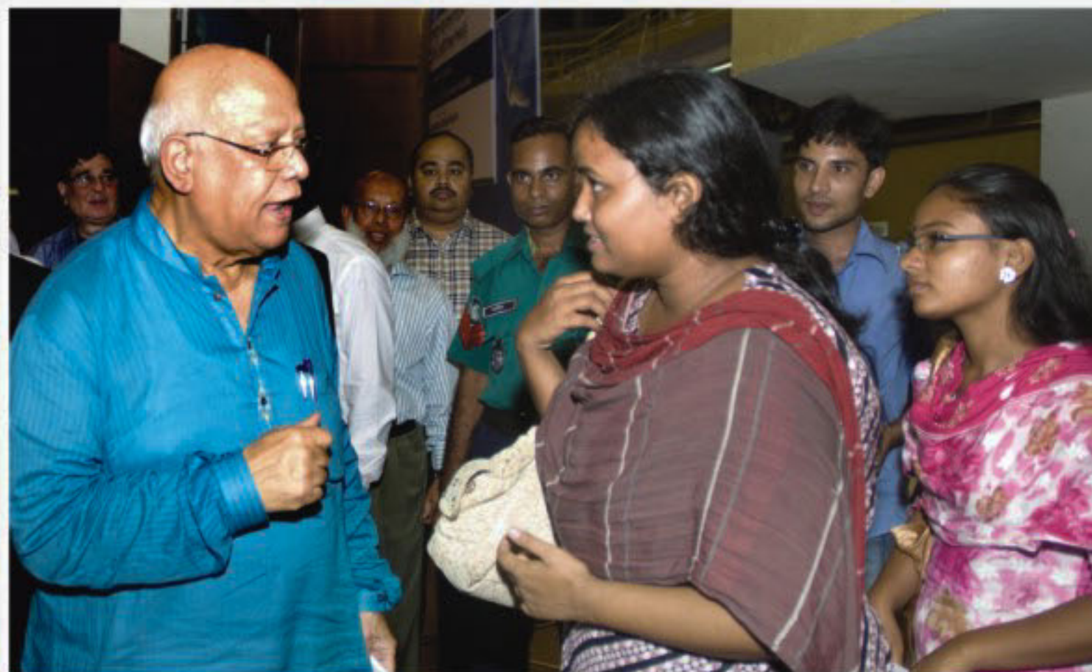
Mr. Abul Maal Abdul Muhith, Honorable Minister of Finance is seen conversing with the Dutch-Bangla Bank scholarship recipients. Students were chosen based on their need for financial aid and the lack of access to educational opportunities based on economic, financial and social factors.