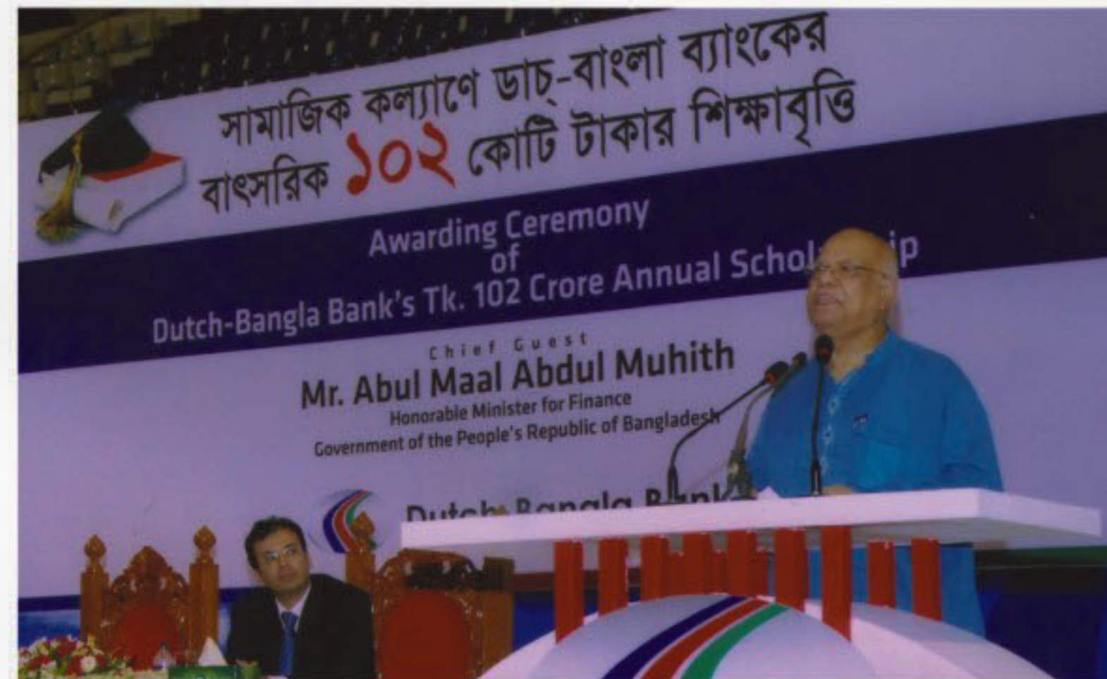
"Today's program is such a program where we are inspired and it seems that our country is going ahead. The contribution of society is more to the individual than he / she is to themselves. The Fascination for education is a rare and good deed. An individual can prove themselves as the best creature when their hidden merit is exhibited. Therefore, I extend my thank to Dutch-Bangla Bank Foundation and hope for the their success in the future." Mr. Abul Maal Abdul Muhith, Honorable Minister of Finance