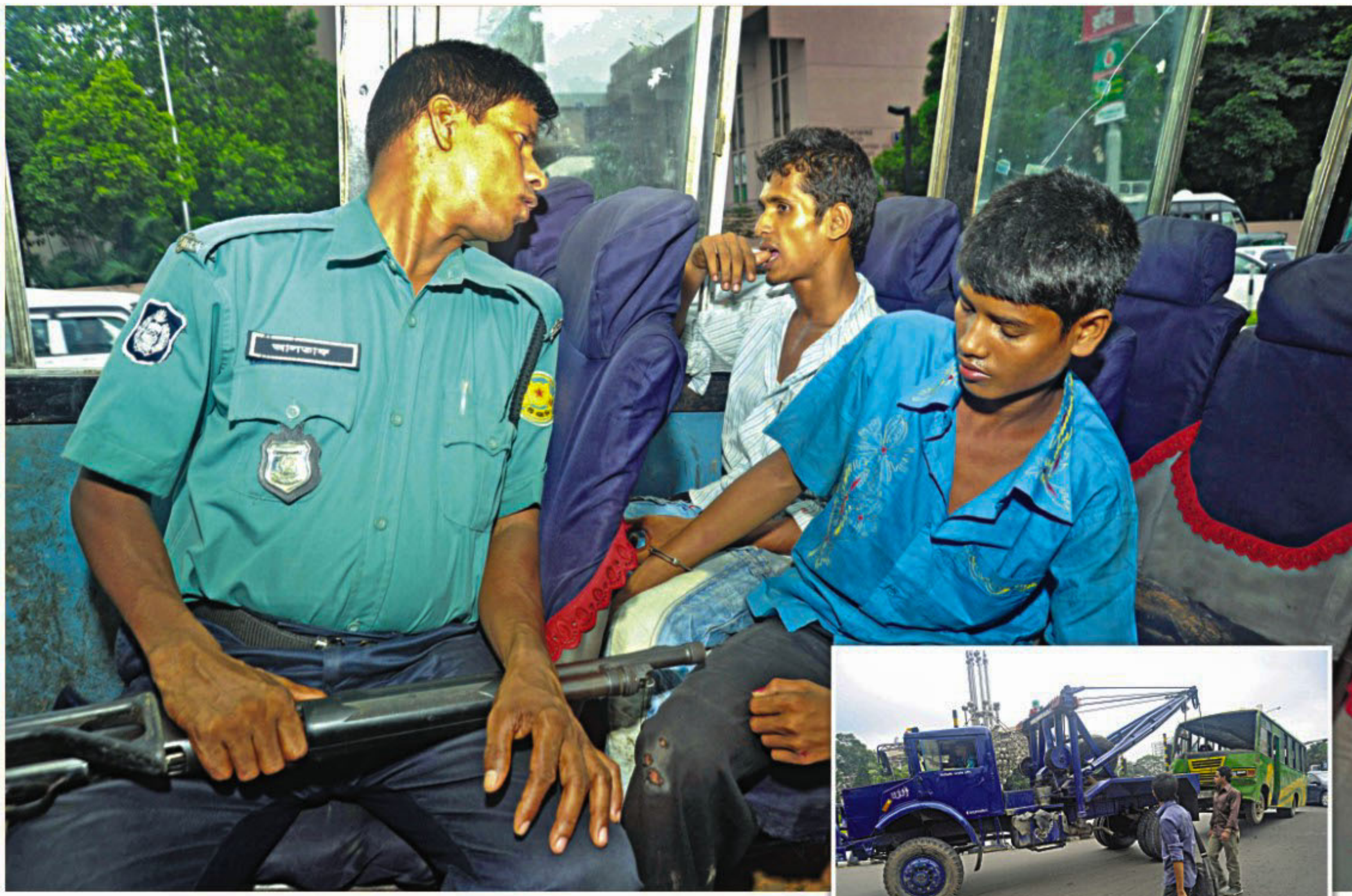
Police pick up two boys, actually the driver and helper of a bus, which ran over a motorcyclist at the city's Bangla Motor yesterday. Inset, a wrecker towing the seized vehicle.