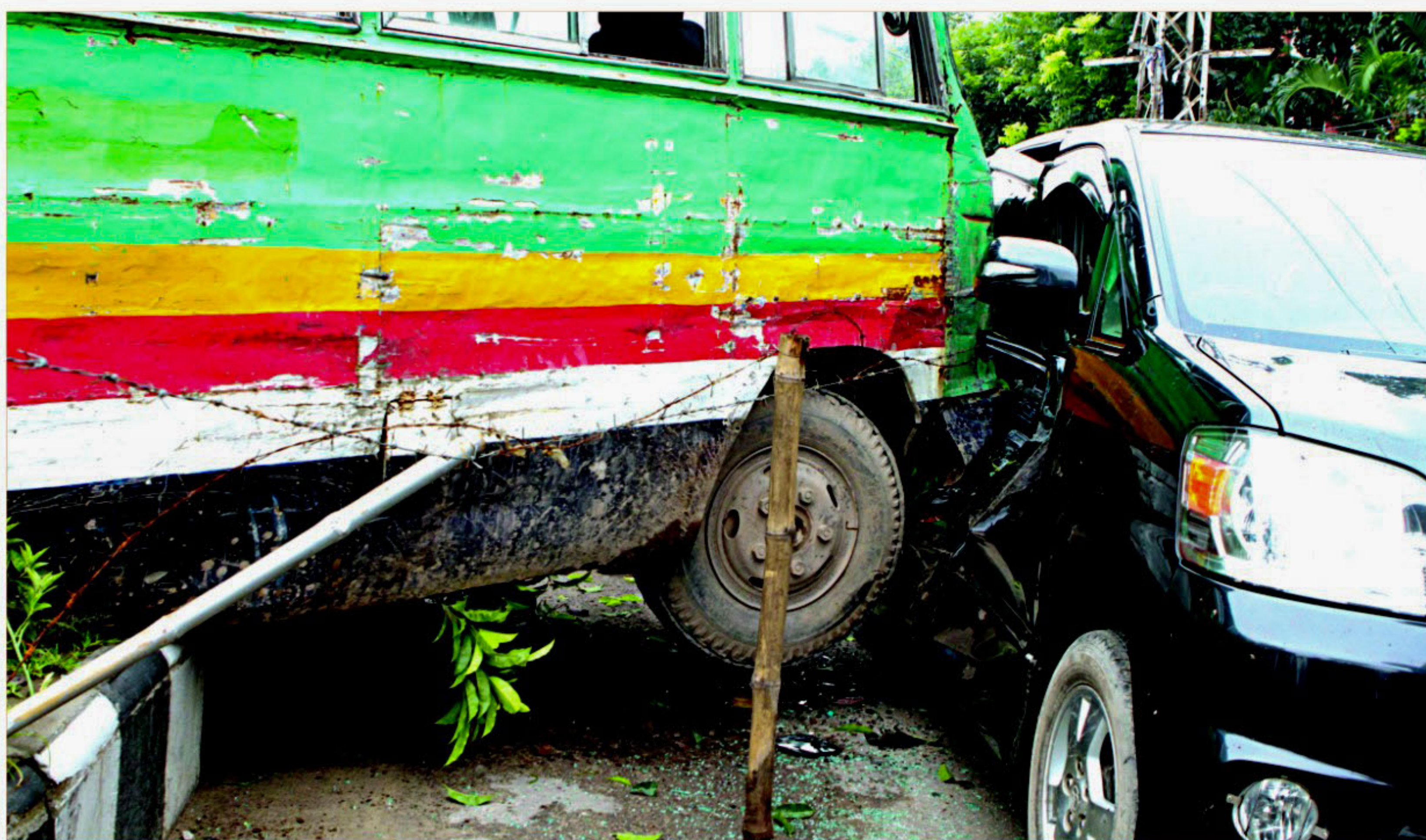
A minibus crossed over the road divider and hit a car yesterday after the driver lost control of the bus in front of Physical Training College on Satmasjid Road in the capital.

Senior BNP leader Moudud Ahmed yesterday said components of the Awami League-led ruling coalition including former president HM Ershad's Jatiya Party who "believe in democracy will join the opposition alliance". In his reaction to Moudud's claim, Ershad said he doesn't believe in democracy of those who had kept him in the jail so that he could not participate in the election. A former military dictator, Ershad was first sent to jail after his fall in 1990. During the BNP rule from 1991 to 1996, he did not get bail in any of the cases filed against him. He was granted bail after AL came to power in 1996. Speaking at a discussion in the capital yesterday afternoon, Moudud said the parties who want to see democracy in the country are joining in the ongoing protests led by BNP Chairperson Khaleda Zia. Swadhinata Forum, a pro-opposition organisation, SEE PAGE 19 COL 8