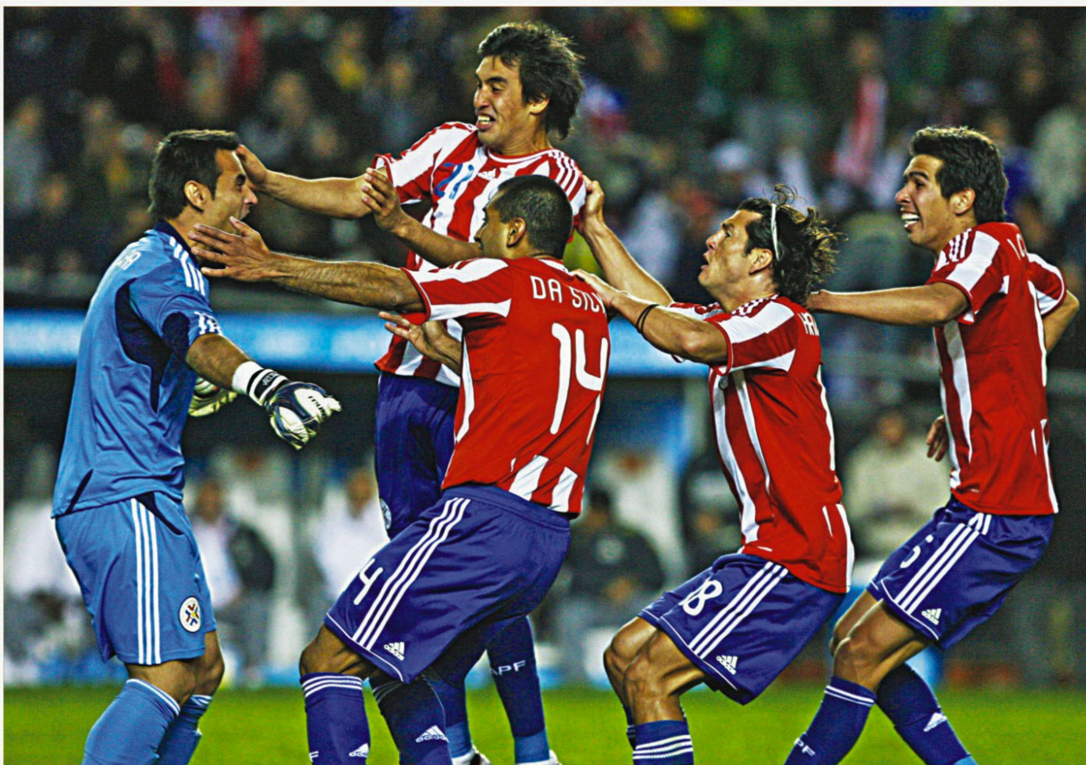
Paraguay players are ecstatic after Brazil missed their fourth penalty in the Copa America quarterfinal shoot-out at the Ciudad de La Plata Stadium in La Plata on Sunday.