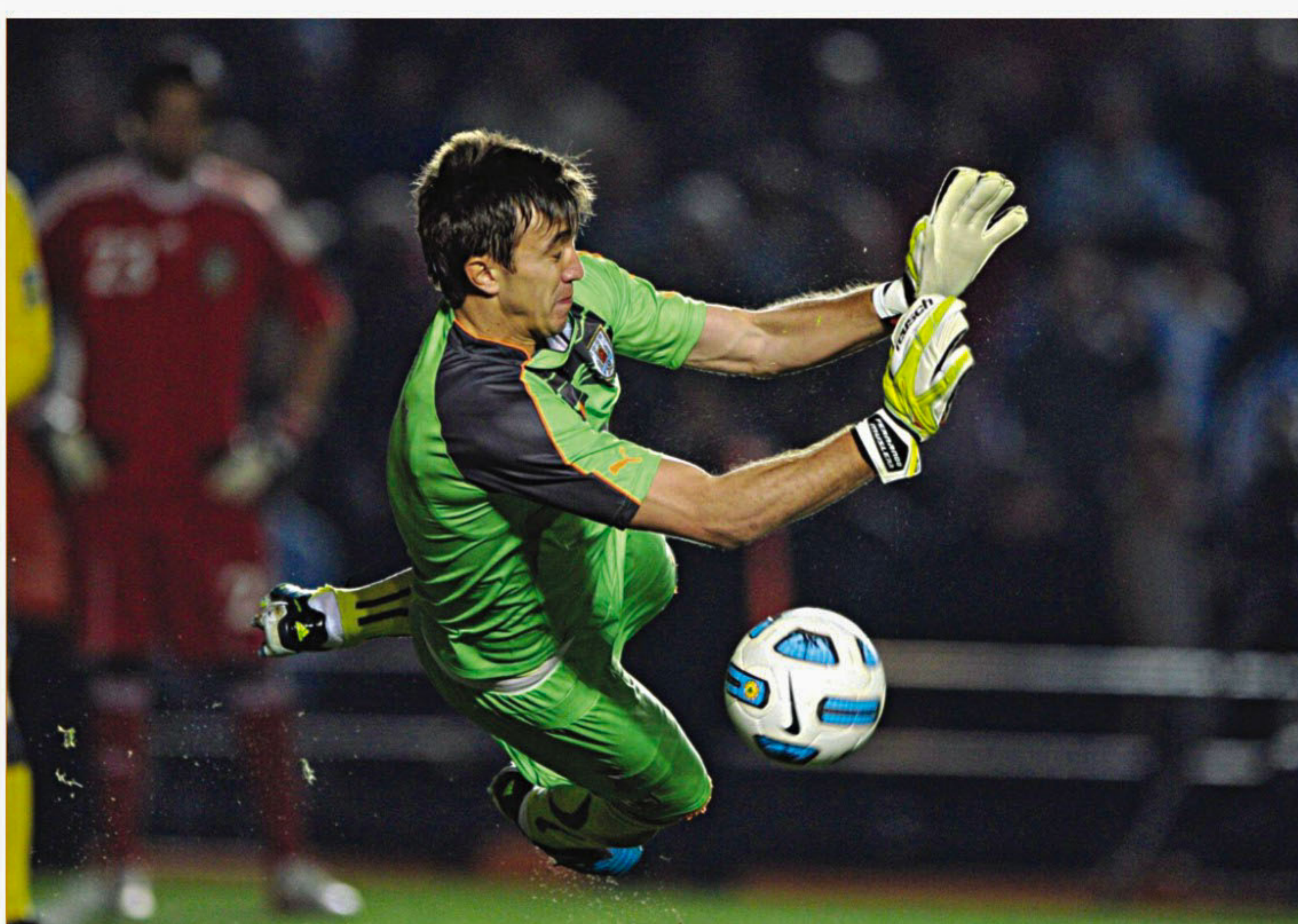
Uruguay goalkeeper Fernando Muslera dives to stop the penalty kick by Argentine forward Carlos Tevez (not in picture), during their Copa America quarterfinal shoot-out, at the Cementerio de Elefantes Stadium in Santa Fe on Saturday.