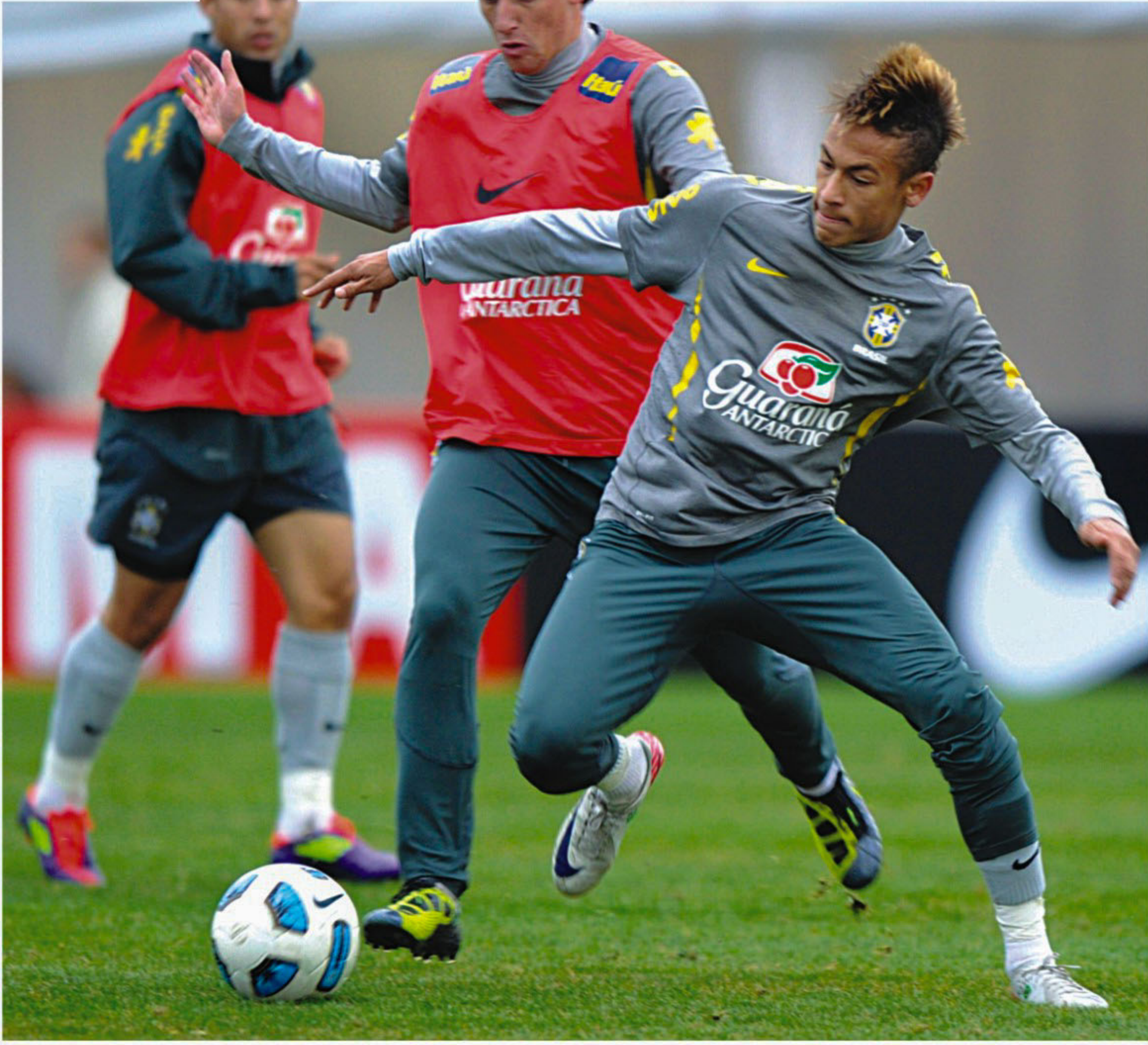
Brazil forward Neymar (R) vies for the ball during a training session at Reserva Los Cardales on Friday. Brazil will face Paraguay in quarterfinals of Copa America on Sunday.

"We know that we cannot just turn up and expect to win games because we are Brazil. We will only get the results we want if we are at our very best," he said.