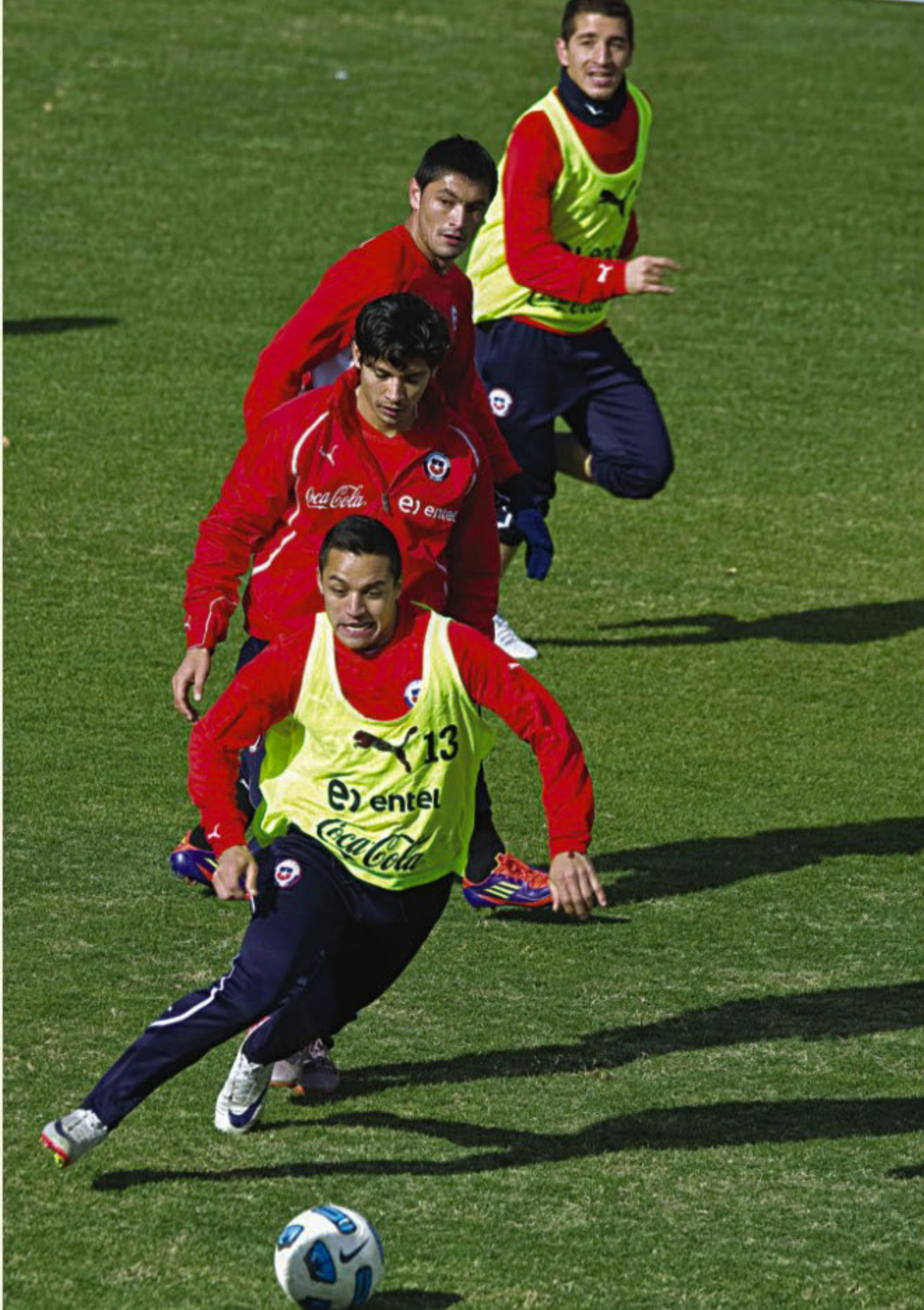
Chile players (bottom to top) Alexis Sanchez, Matias Fernandez, Rodrigo Millar and Carlos Carmona take part in a training session in Mendoza on Friday. Chile will play Venezuela in their Copa America quarterfinal on Sunday.