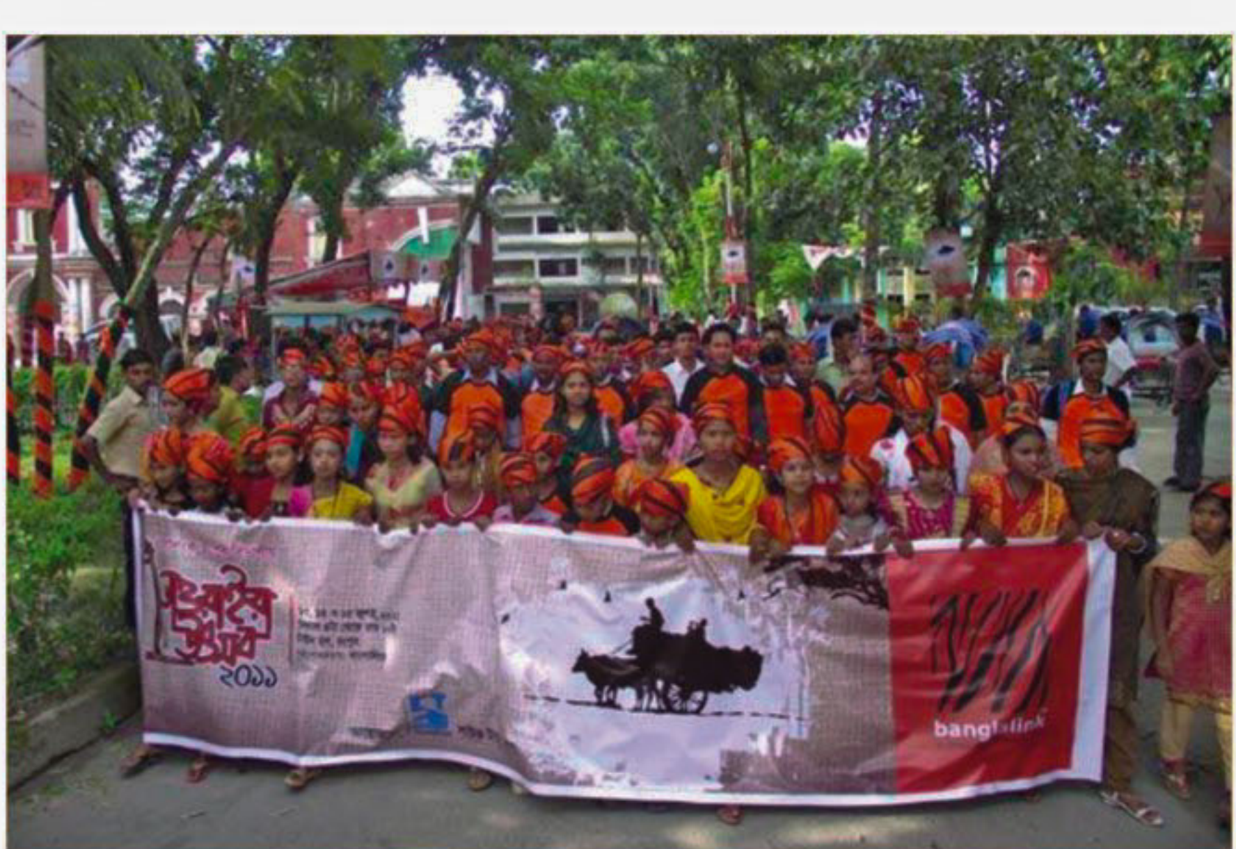
The festival was inaugurated with a colourful rally that paraded the town.