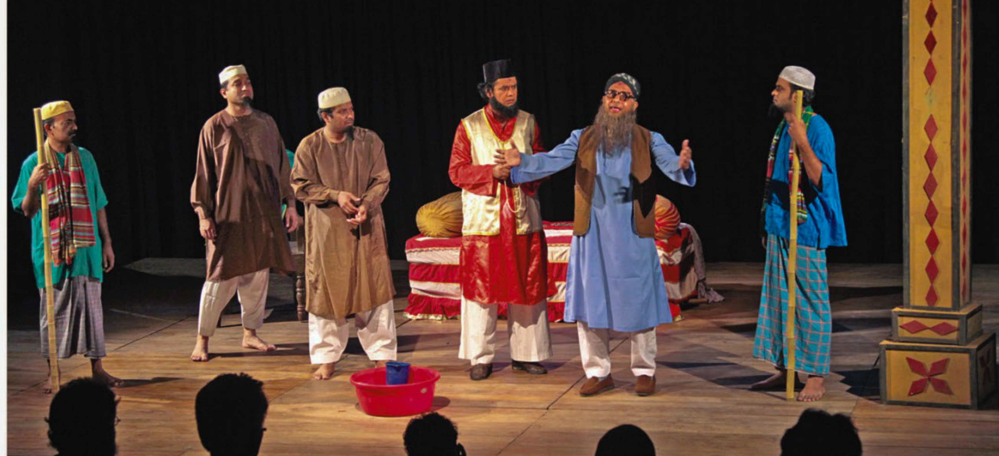
"Meraj Fakir-er Ma" is one of the most successful productions of the troupe.