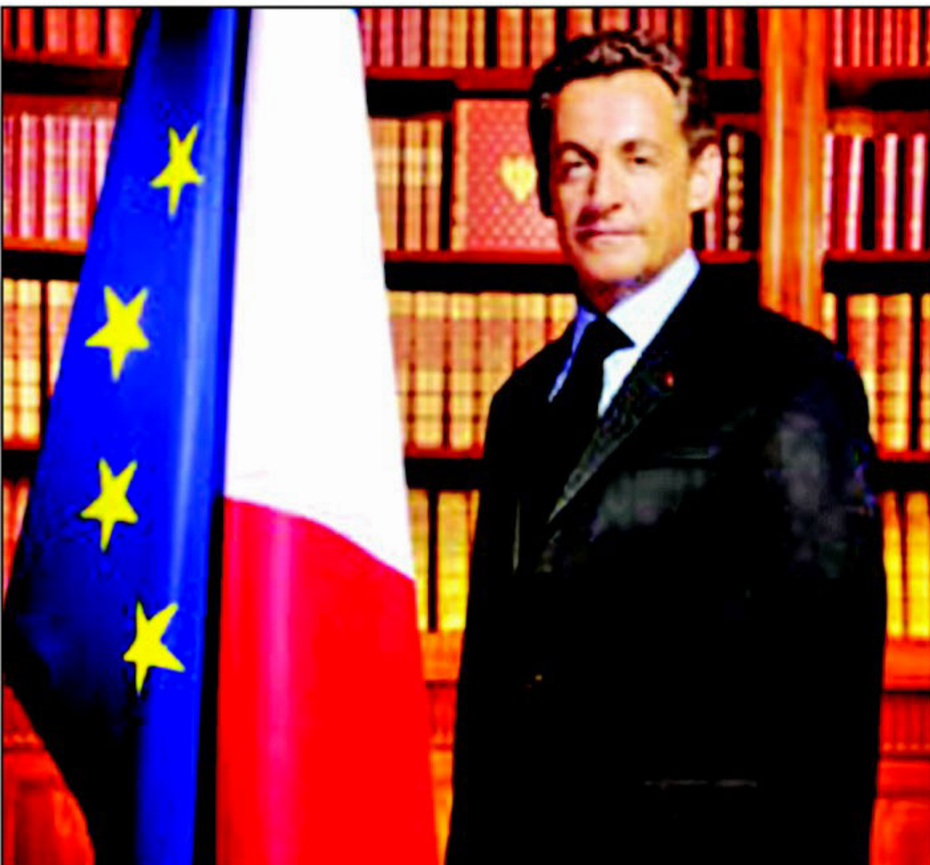
Nicolas Sarkozy, President of France

Commercial Bank of Ceylon felicitates Republic of France on their National Day