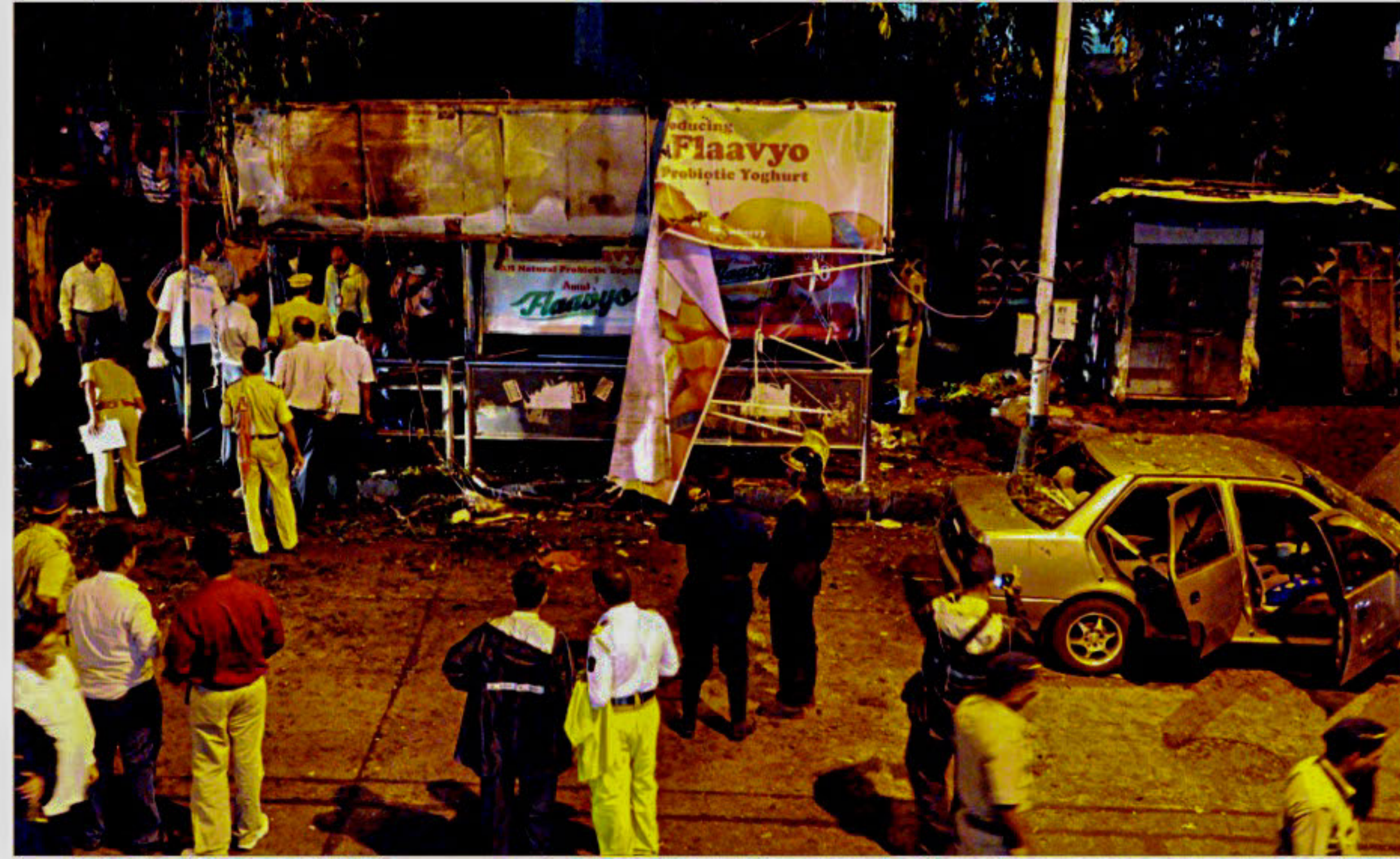
Indian security personnel and investigators gather at a bomb blast site in Dadar district of Mumbai. Multiple blasts rocked India's financial hub yesterday.