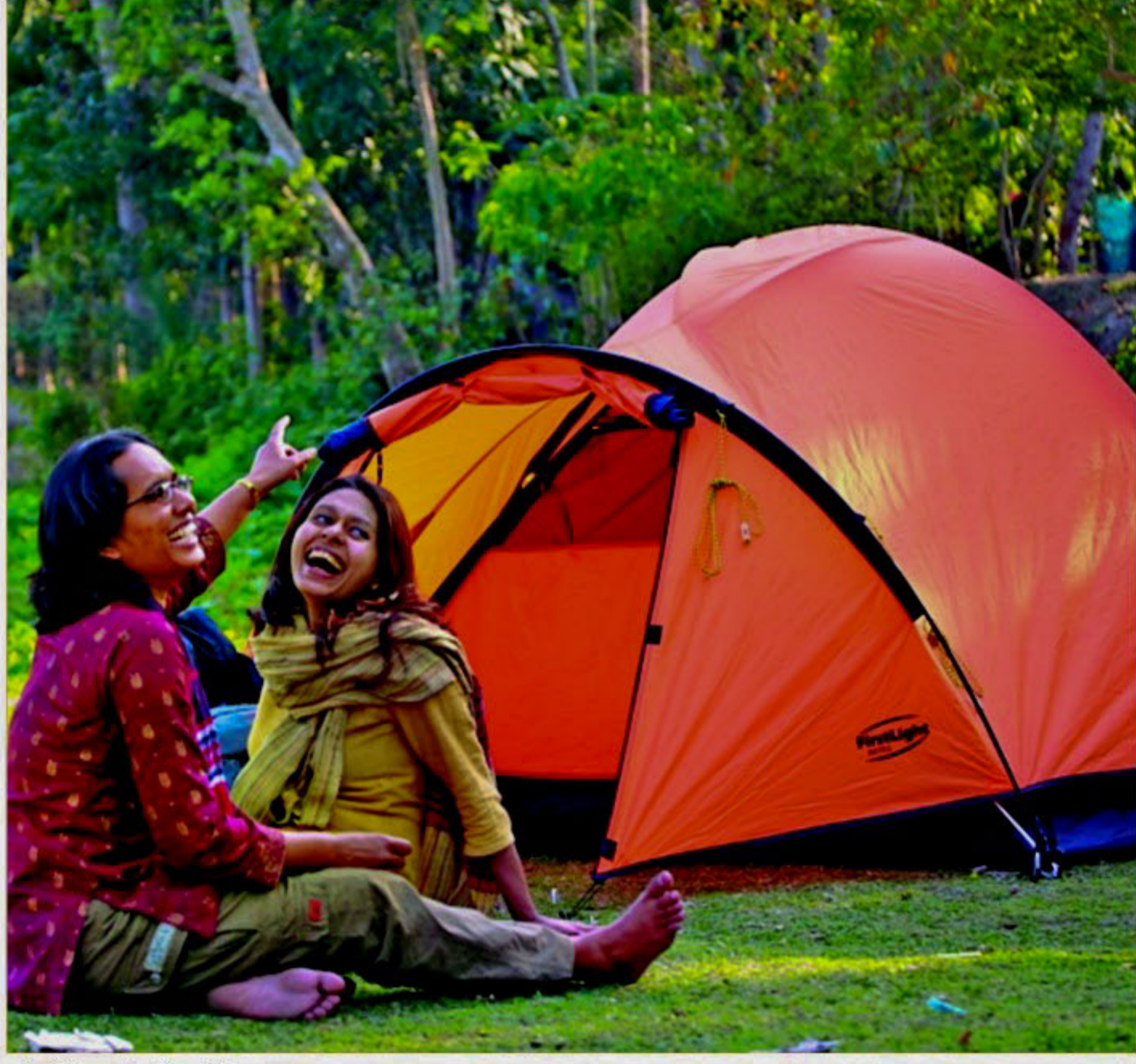
Trekking in the hills.