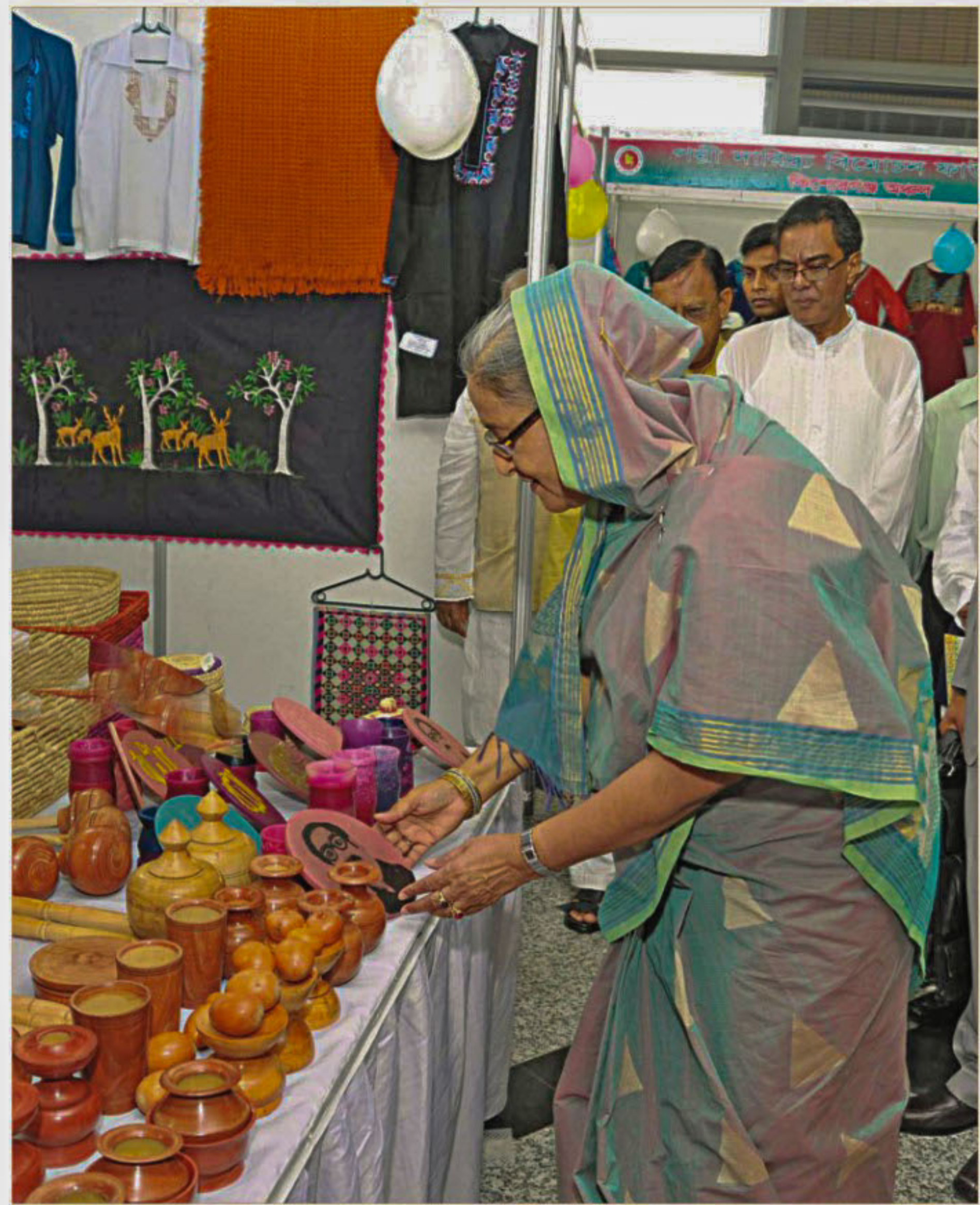
PMO Prime Minister Sheikh Hasina takes a look at a showpiece portraying Bangabandhu Sheikh Mujibur Rahman at a stall during a programme organised to celebrate 12 years of Palli Daridro Bimochon Foundation, at Bangabandhu International Conference Centre in the capital yesterday. Story on B1

The meeting emphasised the need to take immediate steps to remove hassle being faced by exporters and importers of the two