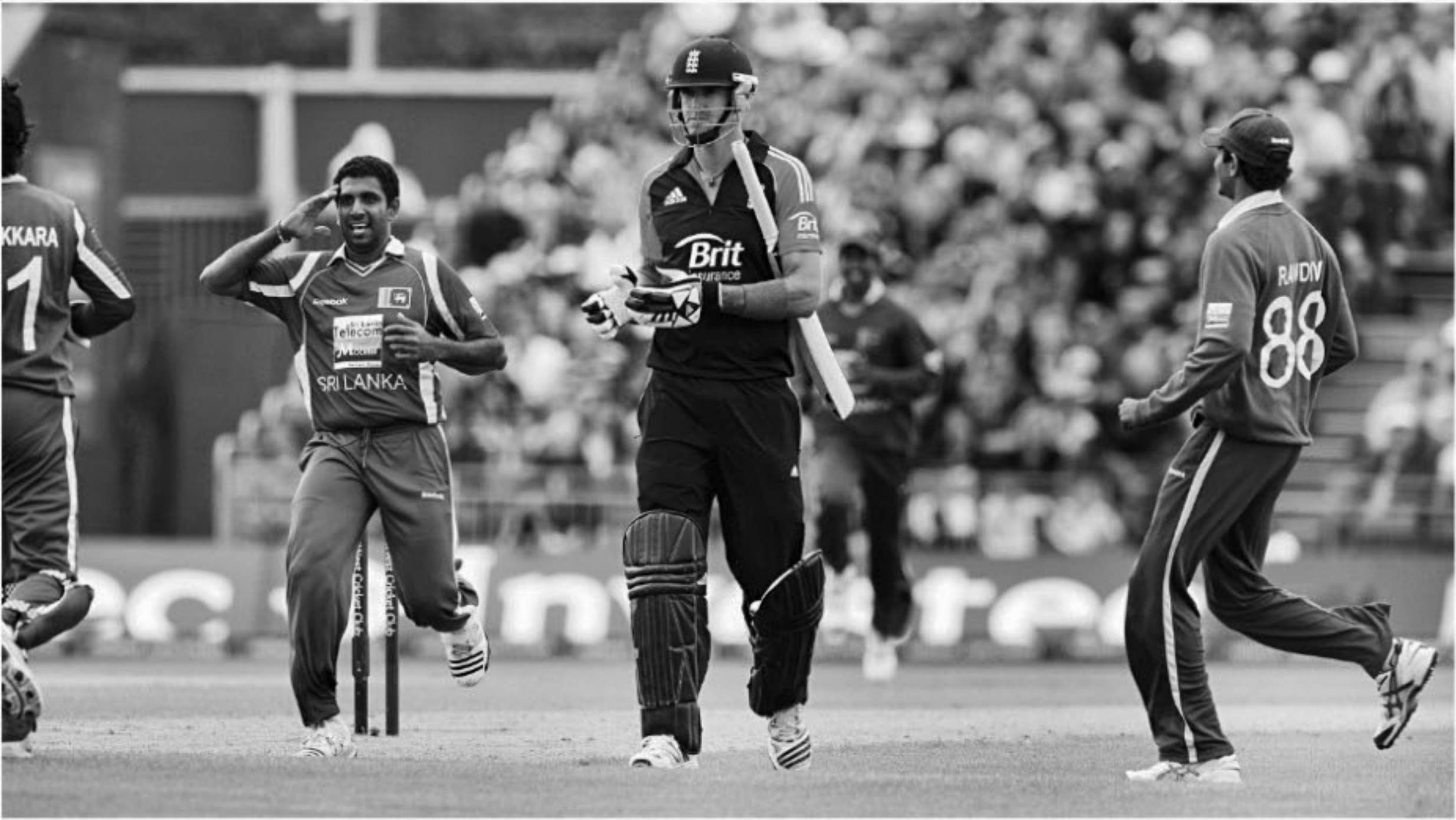
Sri Lanka pace bowler Dhammika Prasad (2nd from L) salutes wicketkeeper Kumar Sangakkara for holding onto a nick offered by misfiring England batsman Kevin Pietersen (C), who was dismissed for 5, in the fifth and final one-dayer at Old Trafford in Manchester yesterday.