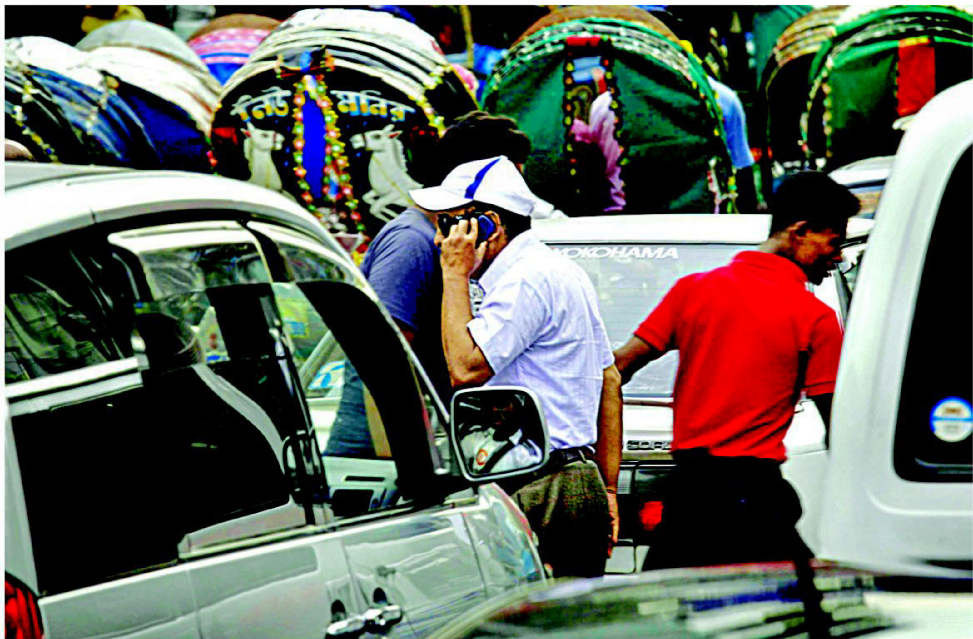
Chatting away on the phone, pedestrians are often seen crossing busy streets oblivious to oncoming traffic. The photo was taken from Purana Paltan yesterday.