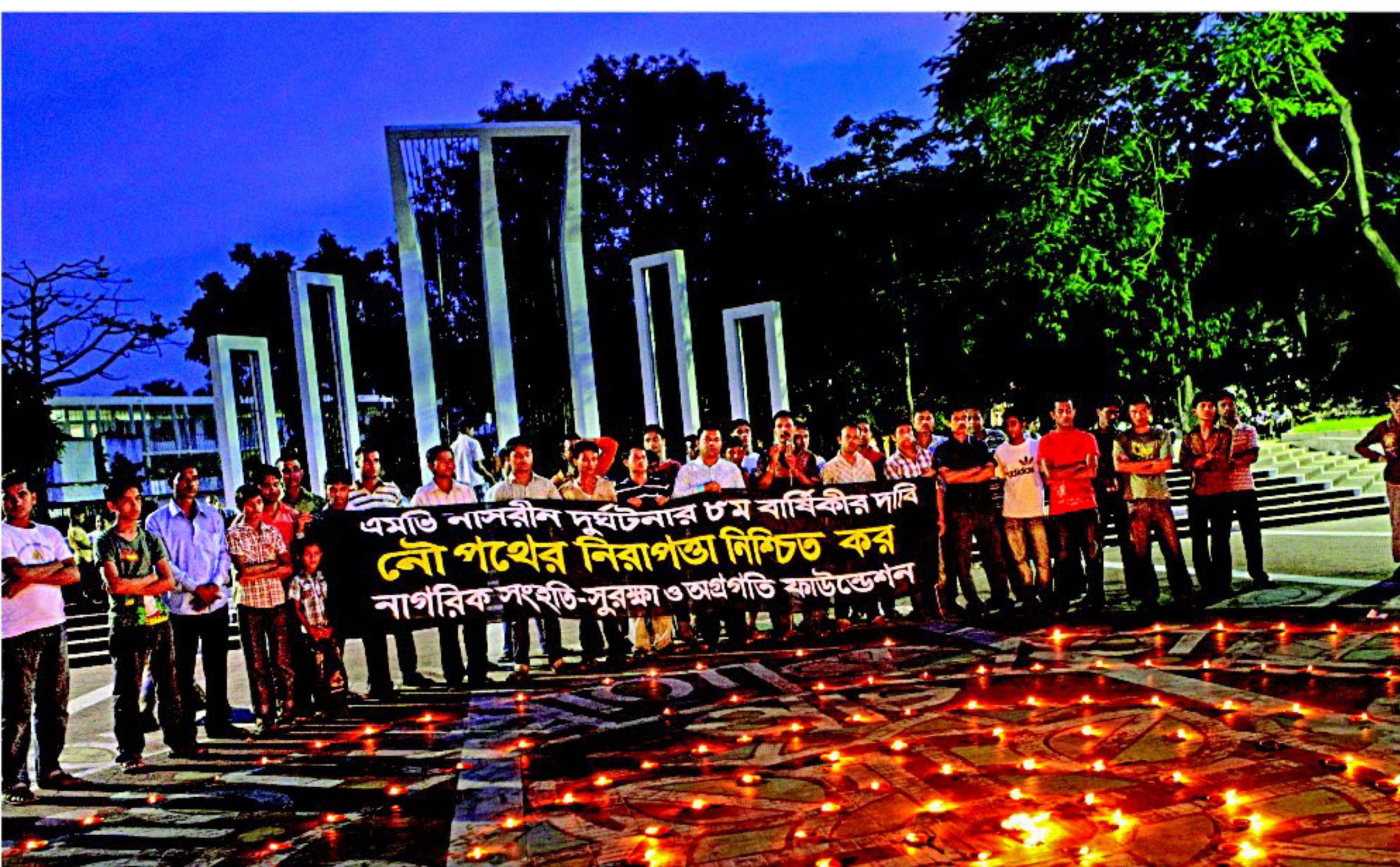
Nagarik Sanghati-Surakhhya O Agragati Foundation at the Central Shaheed Minar yesterday holds a discussion meeting and lights clay lamps remembering the people who died in the MV Nasrin launch disaster eight years ago.