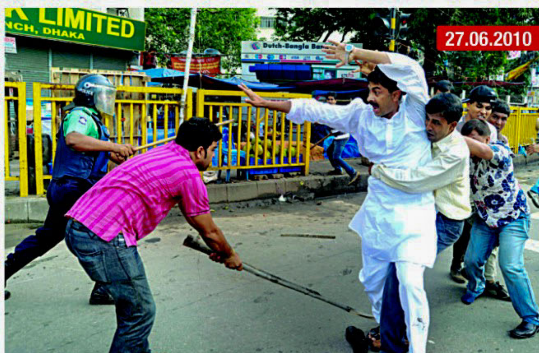
Police action on BNP lawmaker Shahid Uddin Chowdhury Anne at Shahbagh intersection.