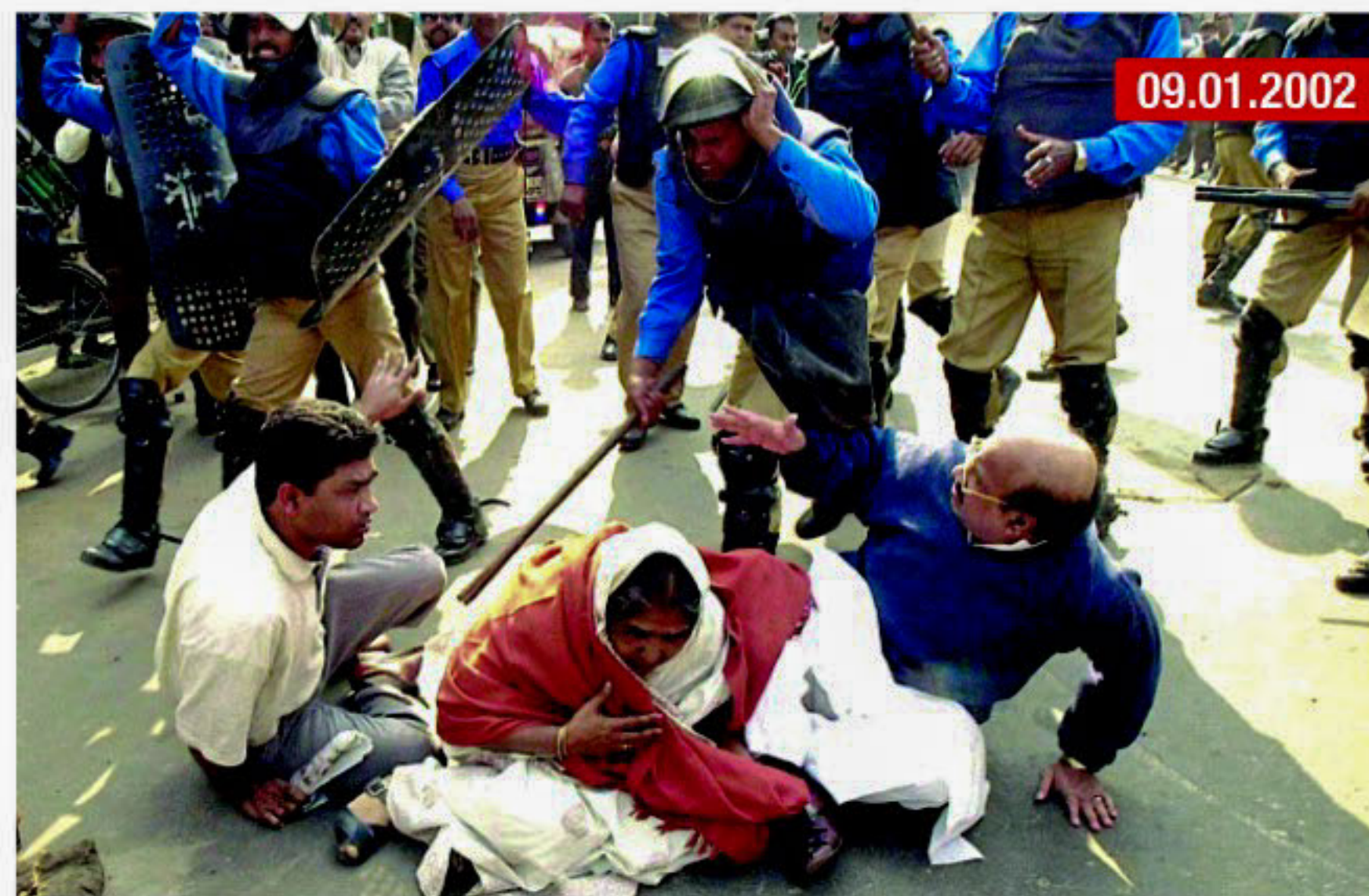
Then opposition leaders Matia Chowdhury and Mohammad Nasim taste the wrath of police during hartal on Bangabandhu Avenue.