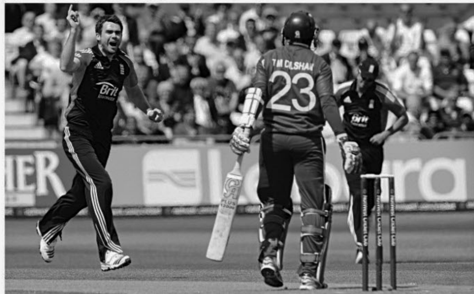
England bowler James Anderson (L) celebrates the wicket of Sri Lanka captain Tillakaratne Dilshan (C) during the fourth ODI at Trent Bridge in Nottingham yesterday. Sri Lanka were 137 for 6 off 34 overs with Kumar Sangakkara unbeaten on 55.

Sri Lanka Cricket's only official response so far has been to state that it is unable to comment given that the team is currently on tour in England.