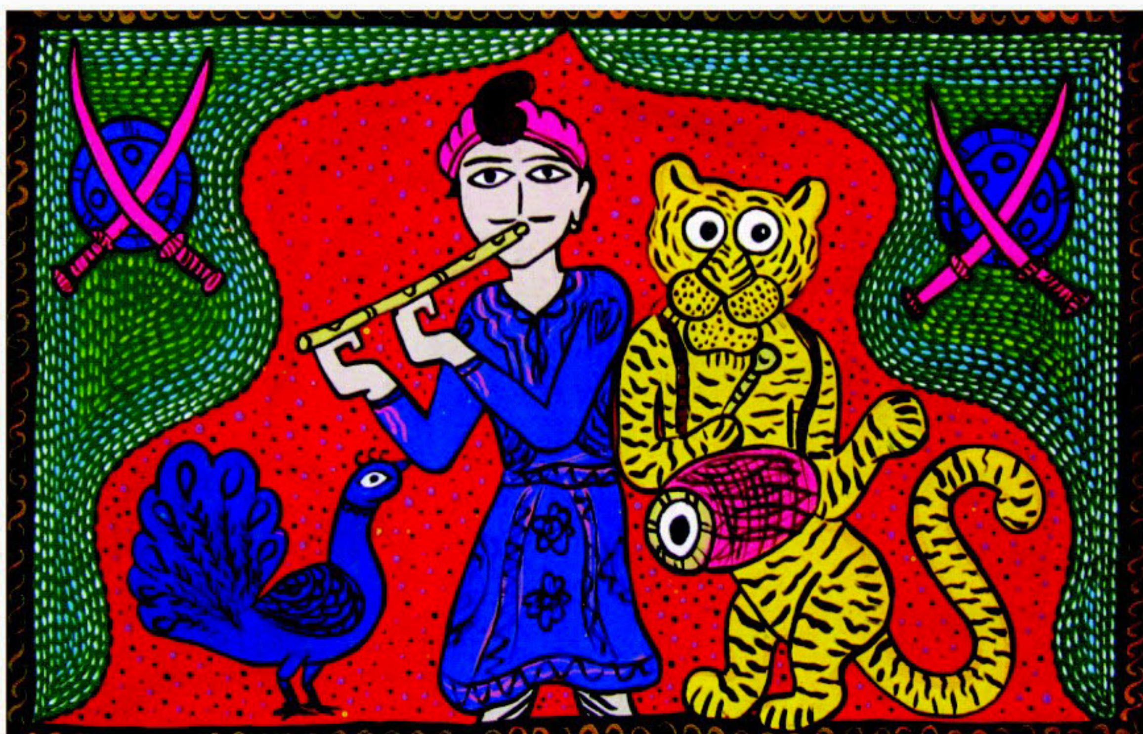
An unrestrained dynamism, combined with patriotic spirit, is noticeable in Nazir's works.