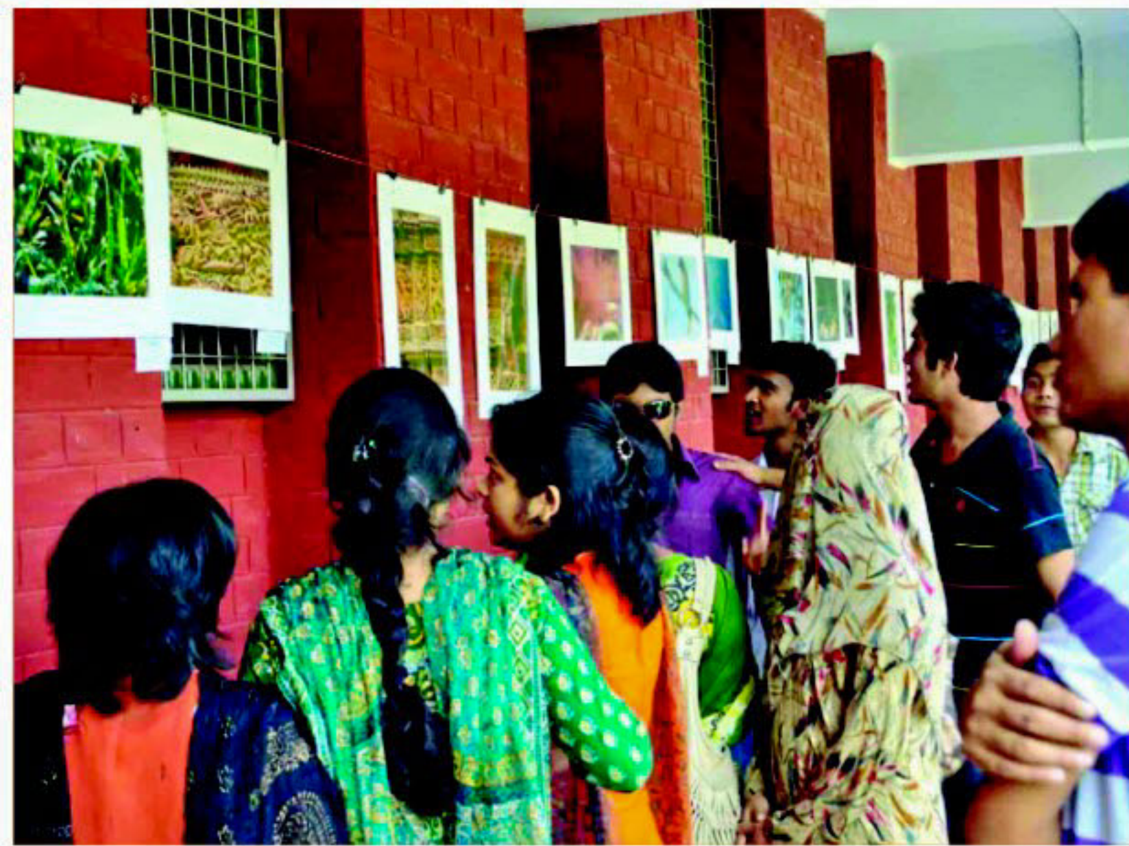
RU students at the exhibition.

Rajshahi Photography Society was formed at 1985. Every year the organisation arranges photography workshops and exhibitions.