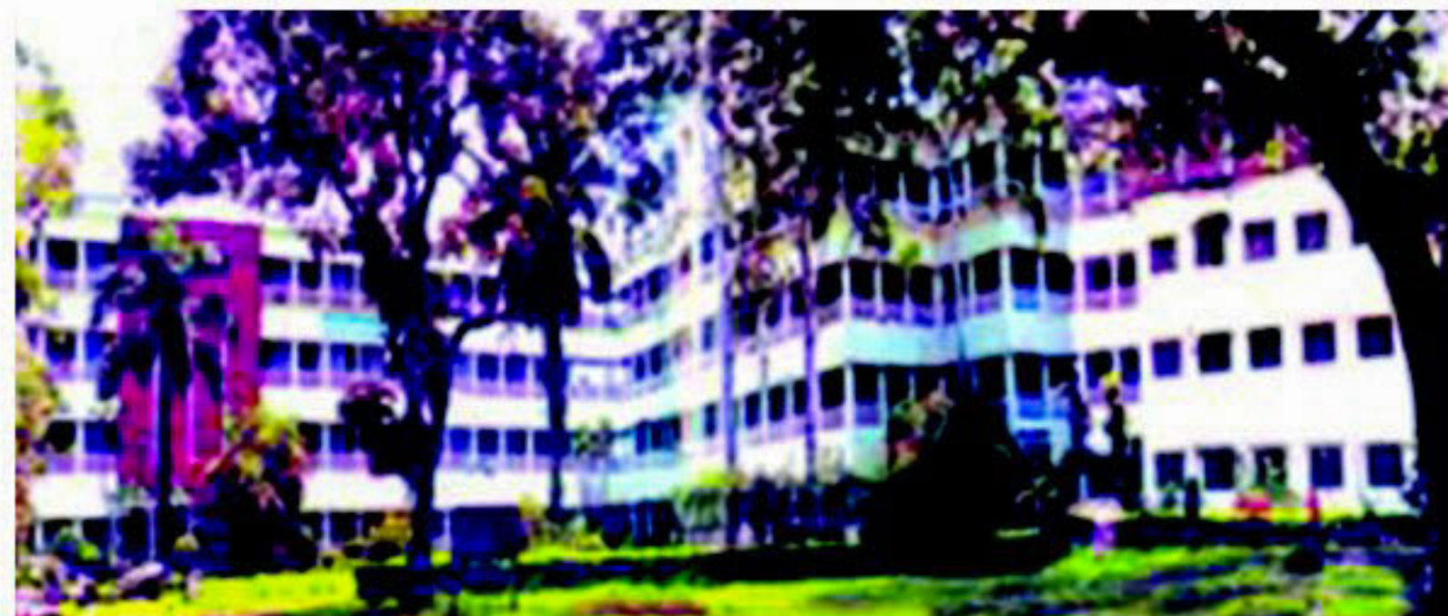
The Nathan Committee (top) appointed by the government of Bengal on May 27, 1912, to draw up a scheme for Dhaka University; the Faculty of Law.