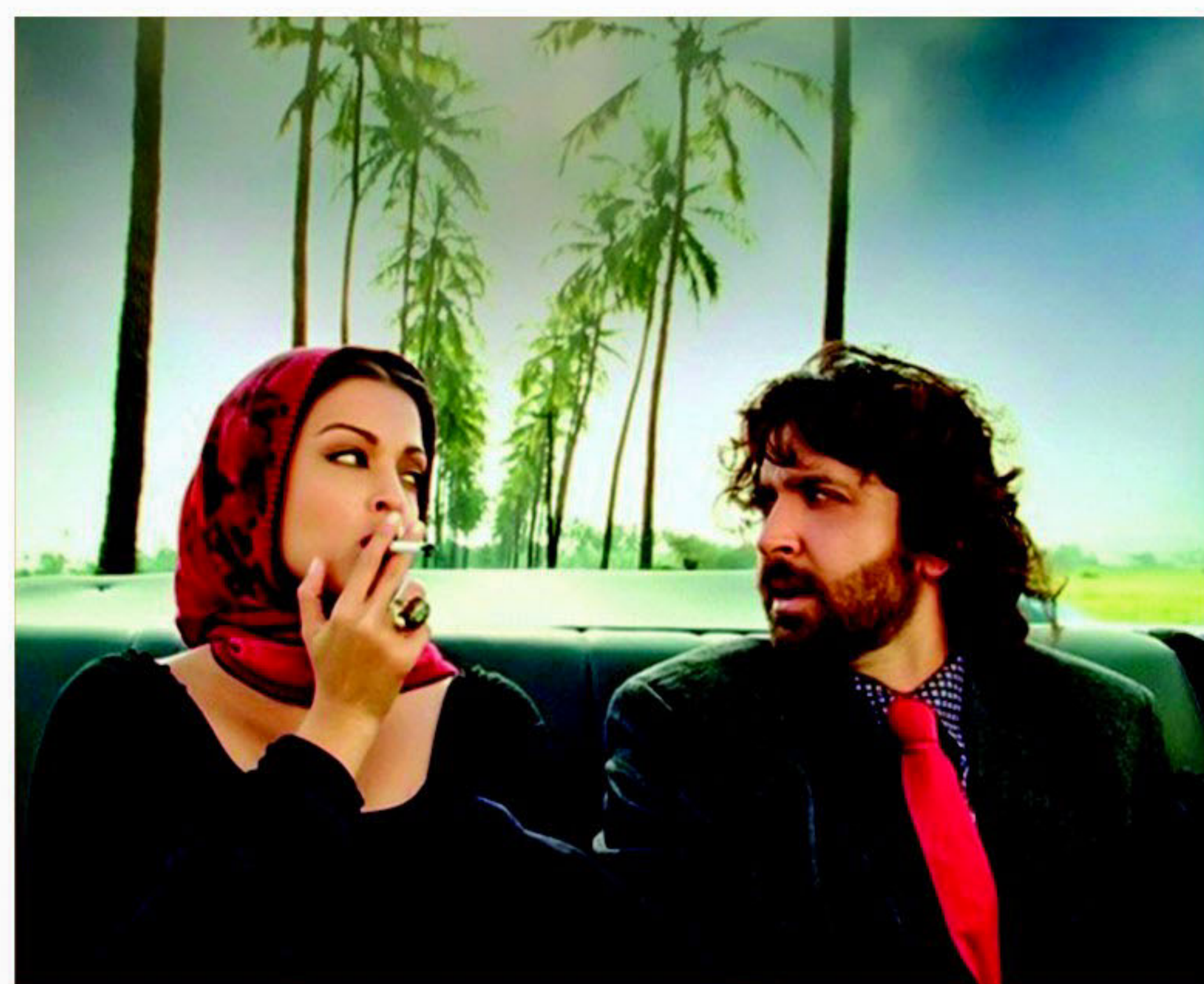
A scene from "Guzaarish"