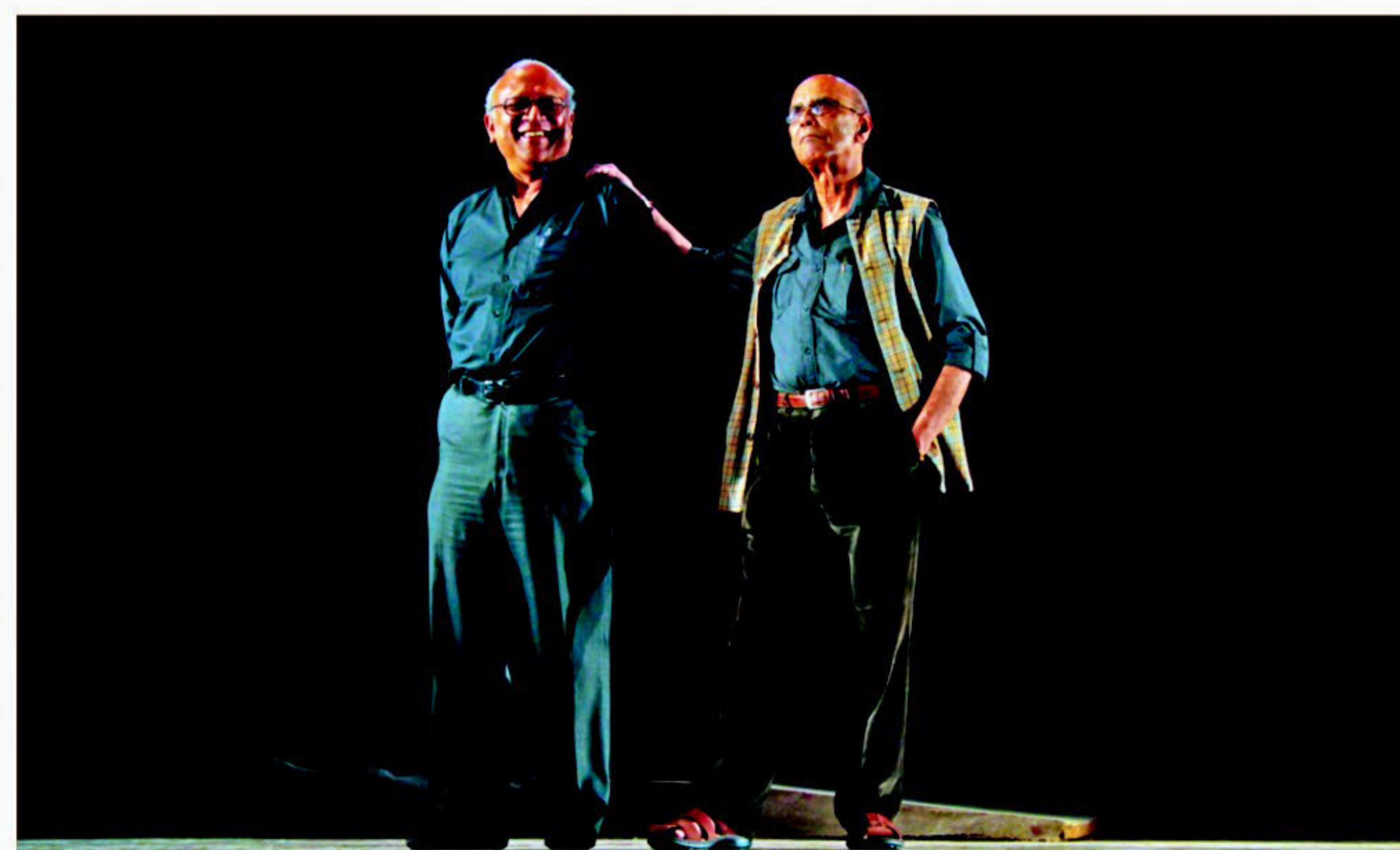
(Top) "Narigon" would be the sixth play by Ataur Rahman and Syed Shamsul Haq; a scene from "Banglar Mati Banglar Jol".

Besides the Battle of Plassey, the play focuses on the conjunction of women's involvement in politics and