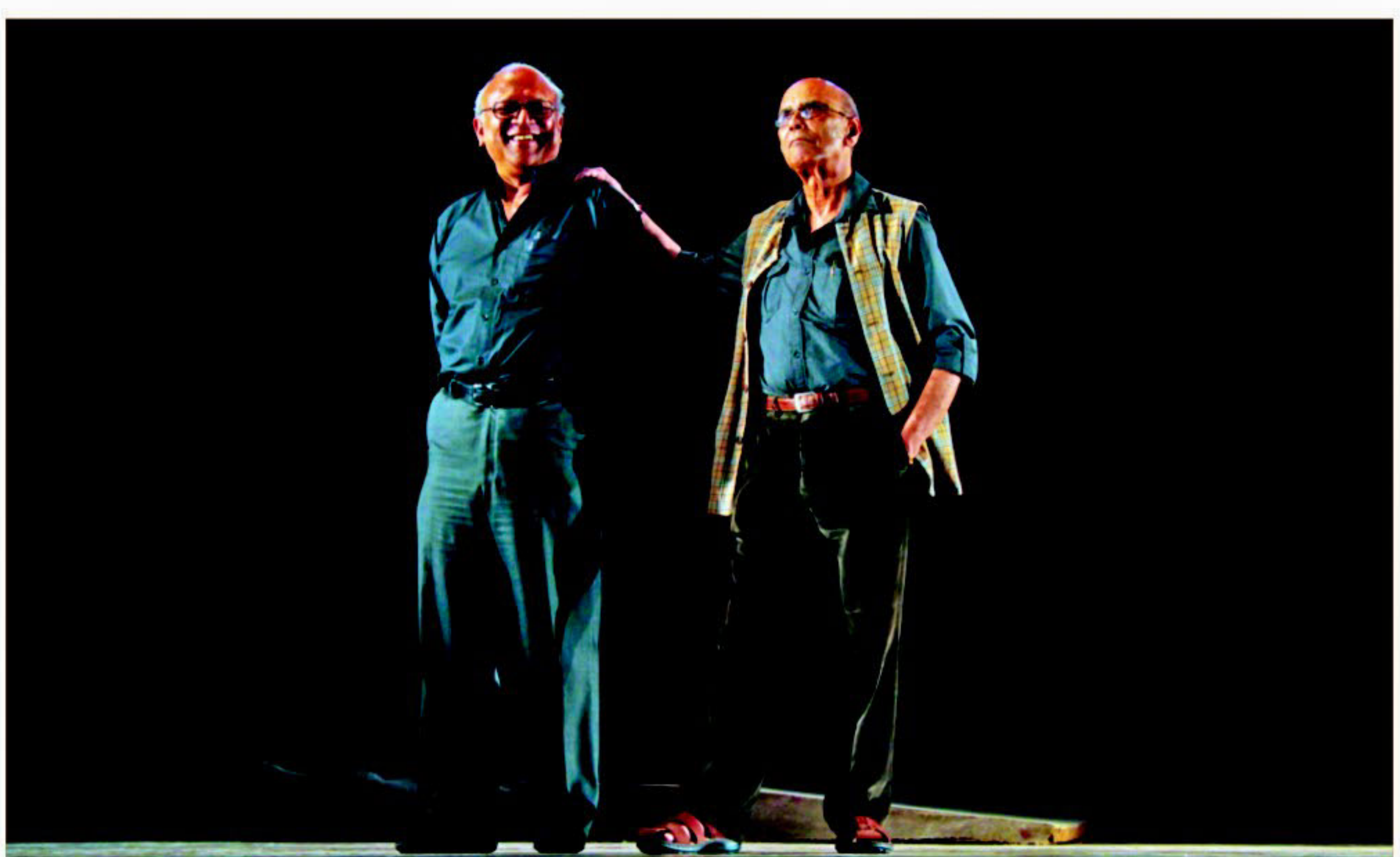
(Top) "Narigon" would be the sixth play by Ataur Rahman and Syed Shamsul Haq; a scene from "Banglar Mati Banglar Jol".