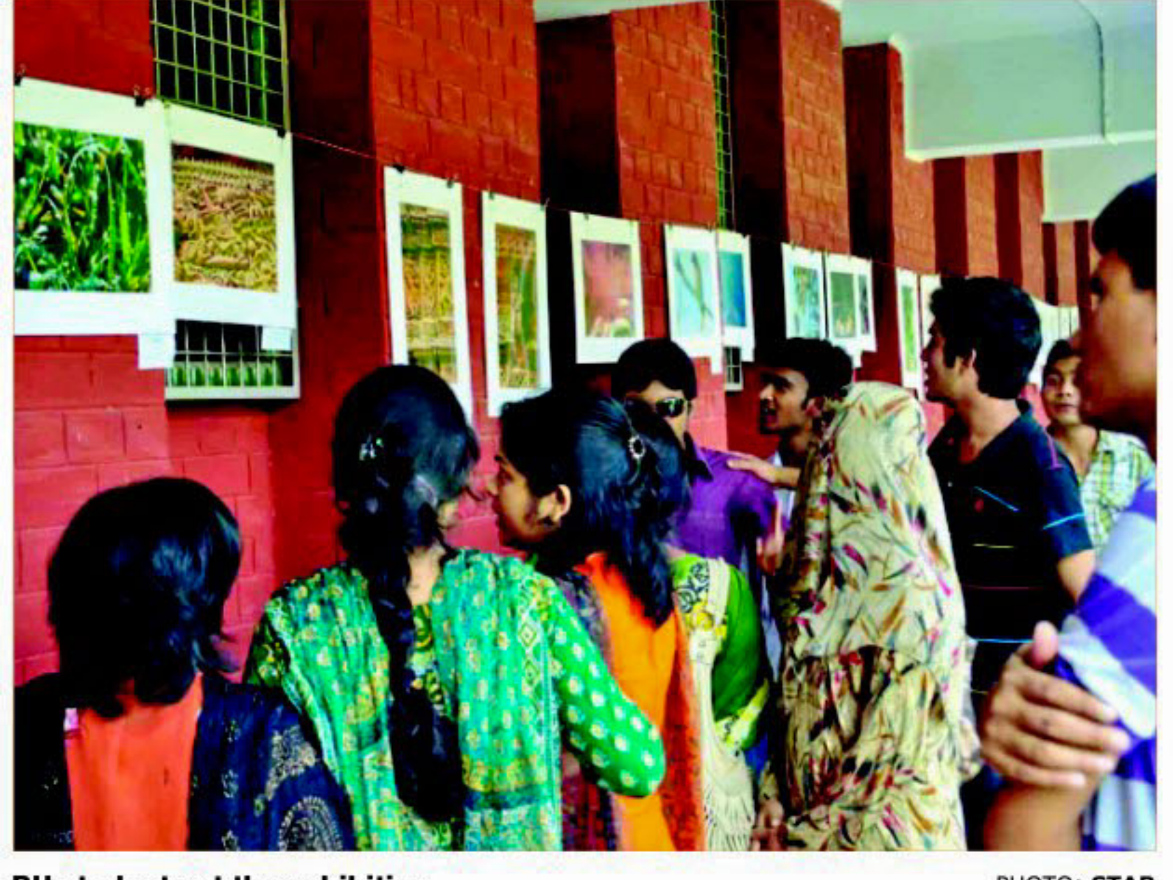
RU students at the exhibition.