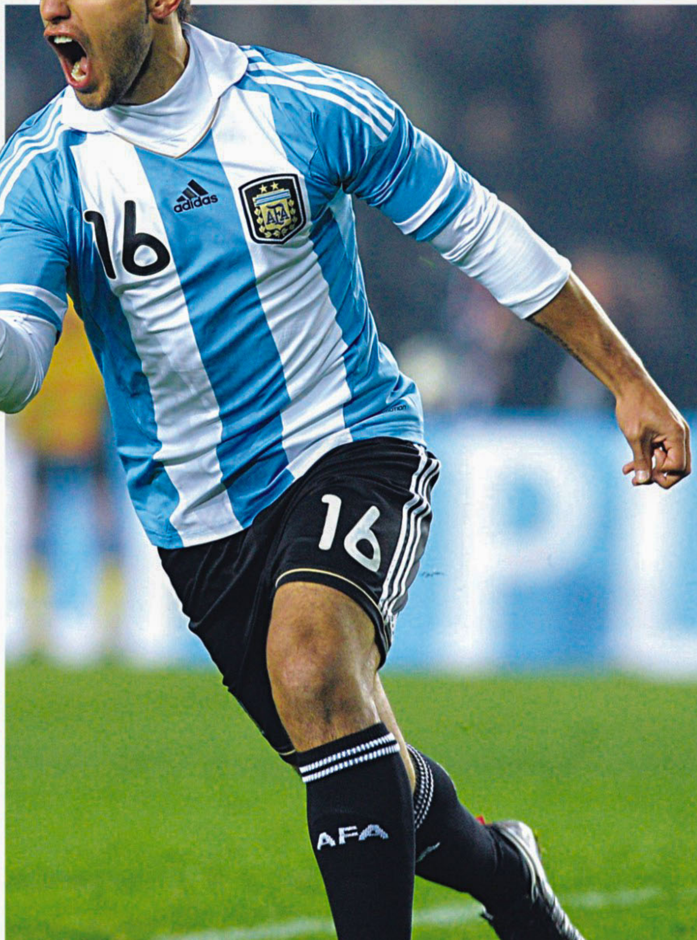
Argentine forward Sergio Aguero is ecstatic after his equaliser against Bolivia during their Copa America clash at the Ciudad de La Plata Stadium on Friday.