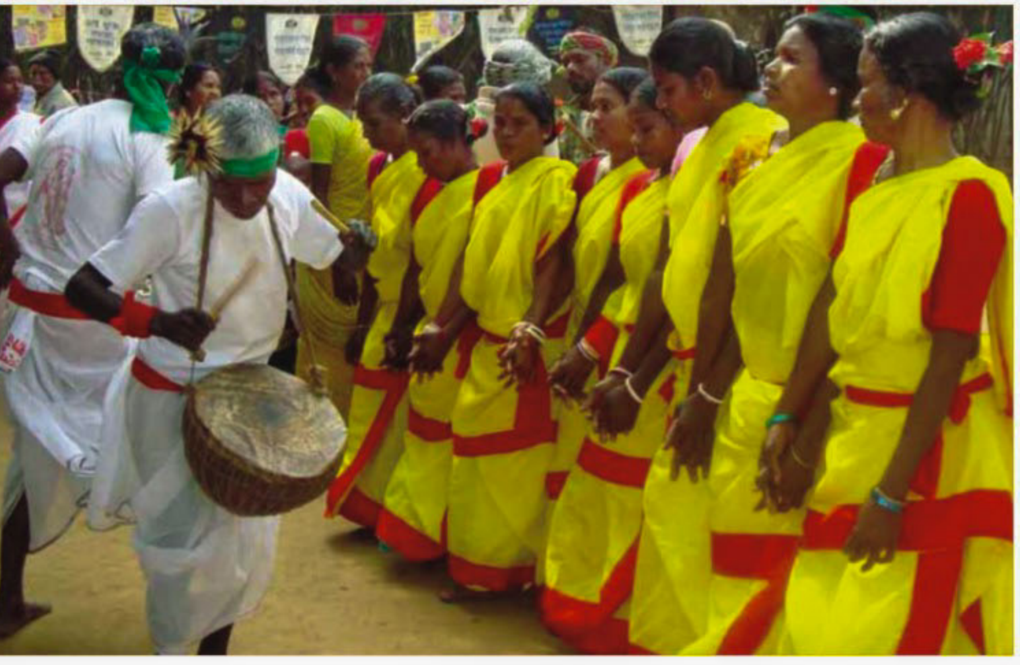
A colourful dance sequence at the festival.

In Phulbari, a programme was organised at Betdighi Purba