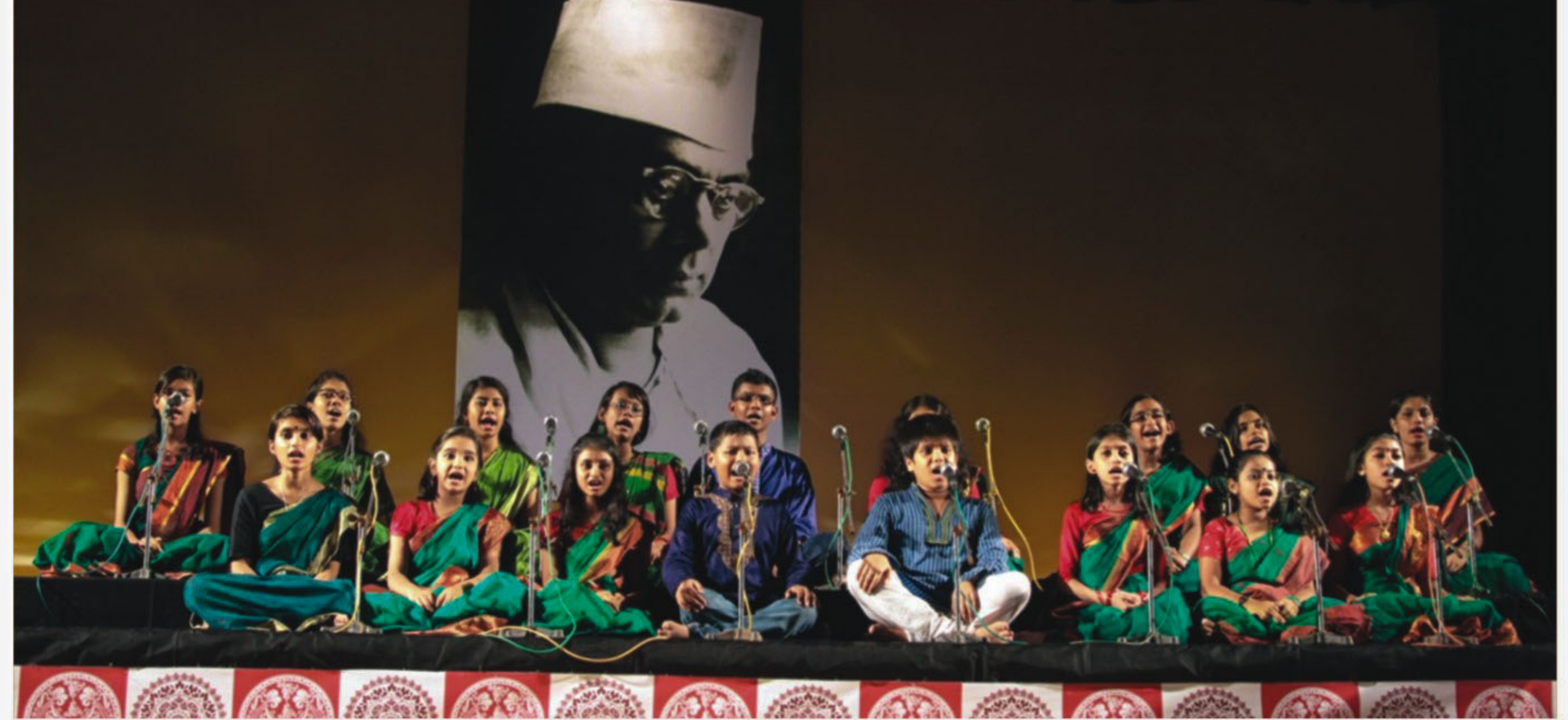
Child artistes of Chhayanaut present a choral rendition.