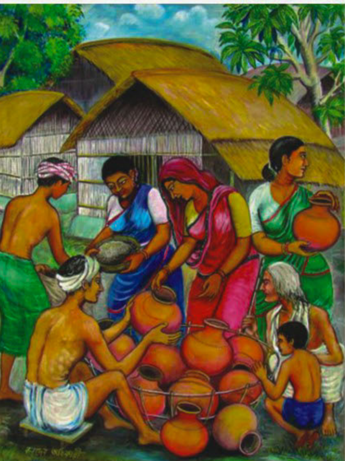
Artworks on display.