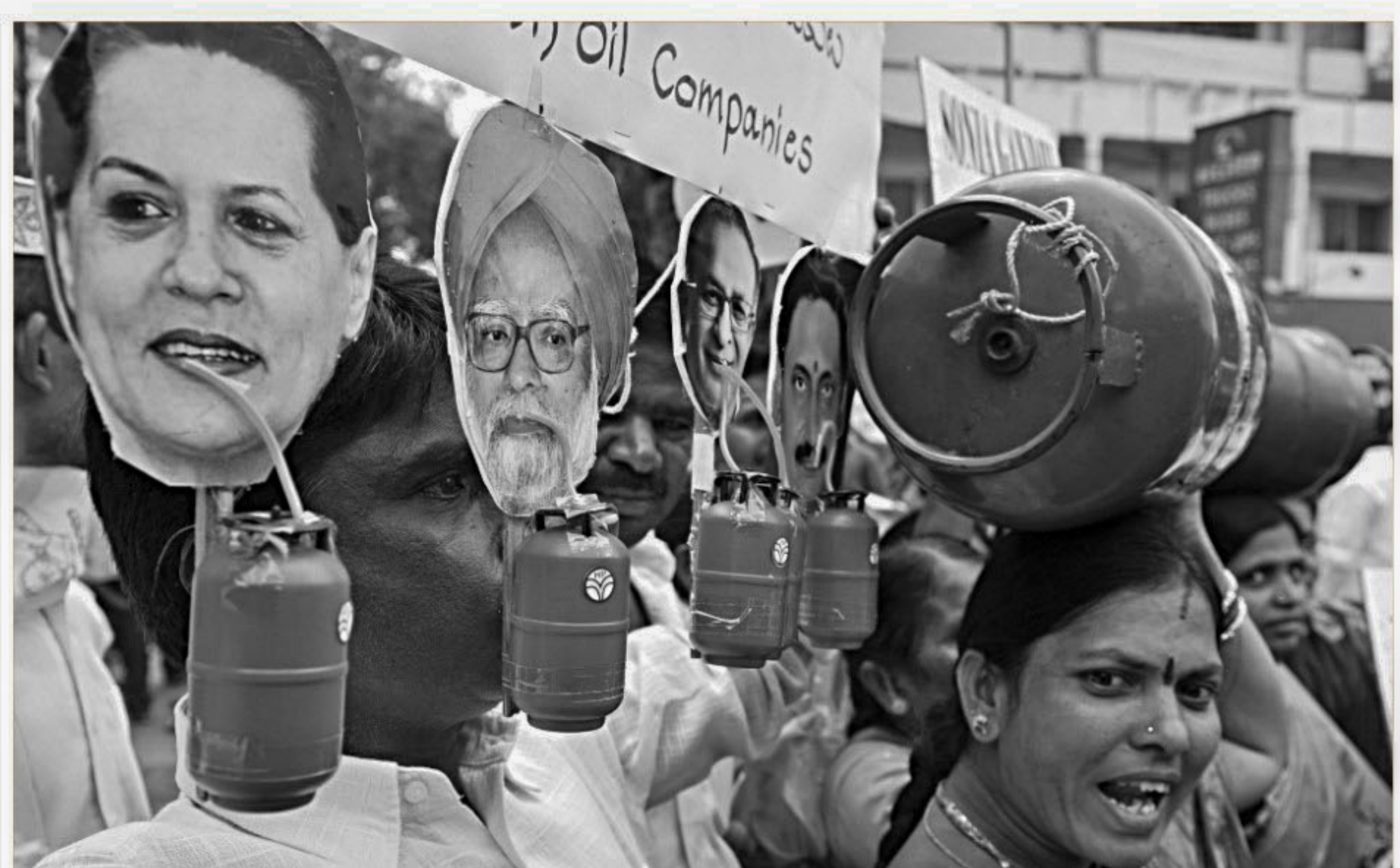
An Indian activist from the Telugu Desam Party (TDP) holds a gas canister on her head while protesting against the United Progressive Alliance (UPA) ruling party during a demonstration against fuel price hikes in Hyderabad yesterday.

Roadside bombs planted by Taliban-led militants are a frequent cause of casualties among civilians.