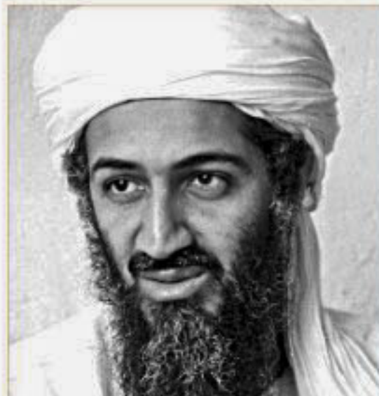
Osama bin Laden

"The trove makes it clear that bin Laden's primary goal -- you can call it an obsession -- was to attack the US homeland," The Post quotes an unnamed senior US counterterrorism official as saying. "He pushed for this every way he could."