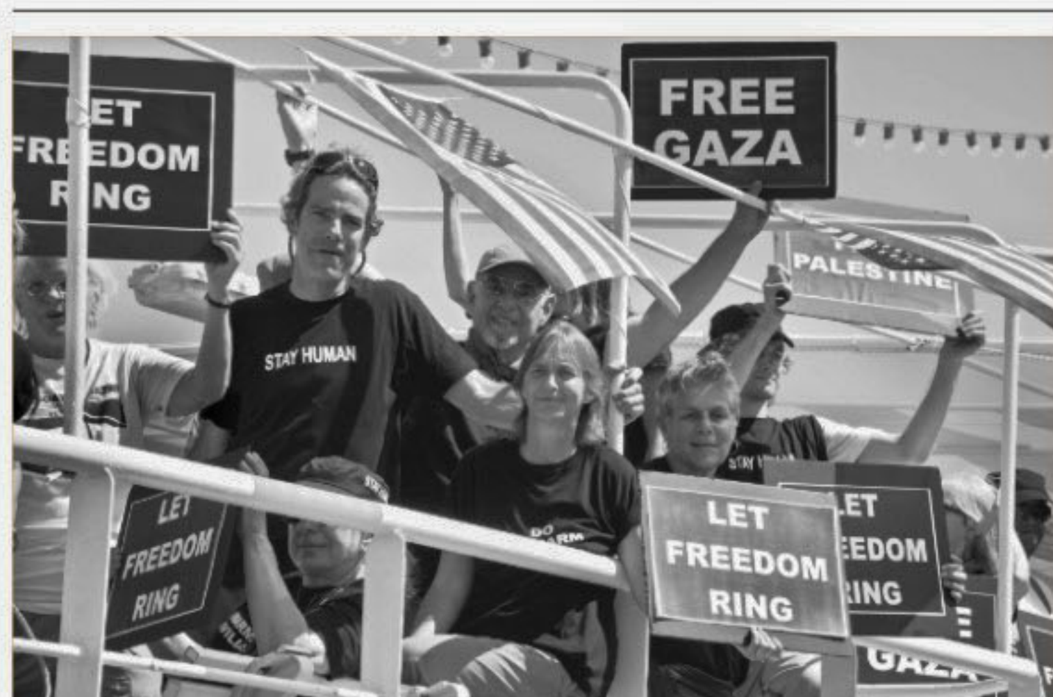
Passengers on a US Gaza-bound boat prepare to set sail from Athens yesterday to join the flotilla to Gaza. Activists accused Israel of sabotaging ships in a bid to force them to quit the movement.

Factories have changed shifts to make use of cooler evenings and early mornings, prompting nursery schools to also open weekends to cater for the needs of working parents.