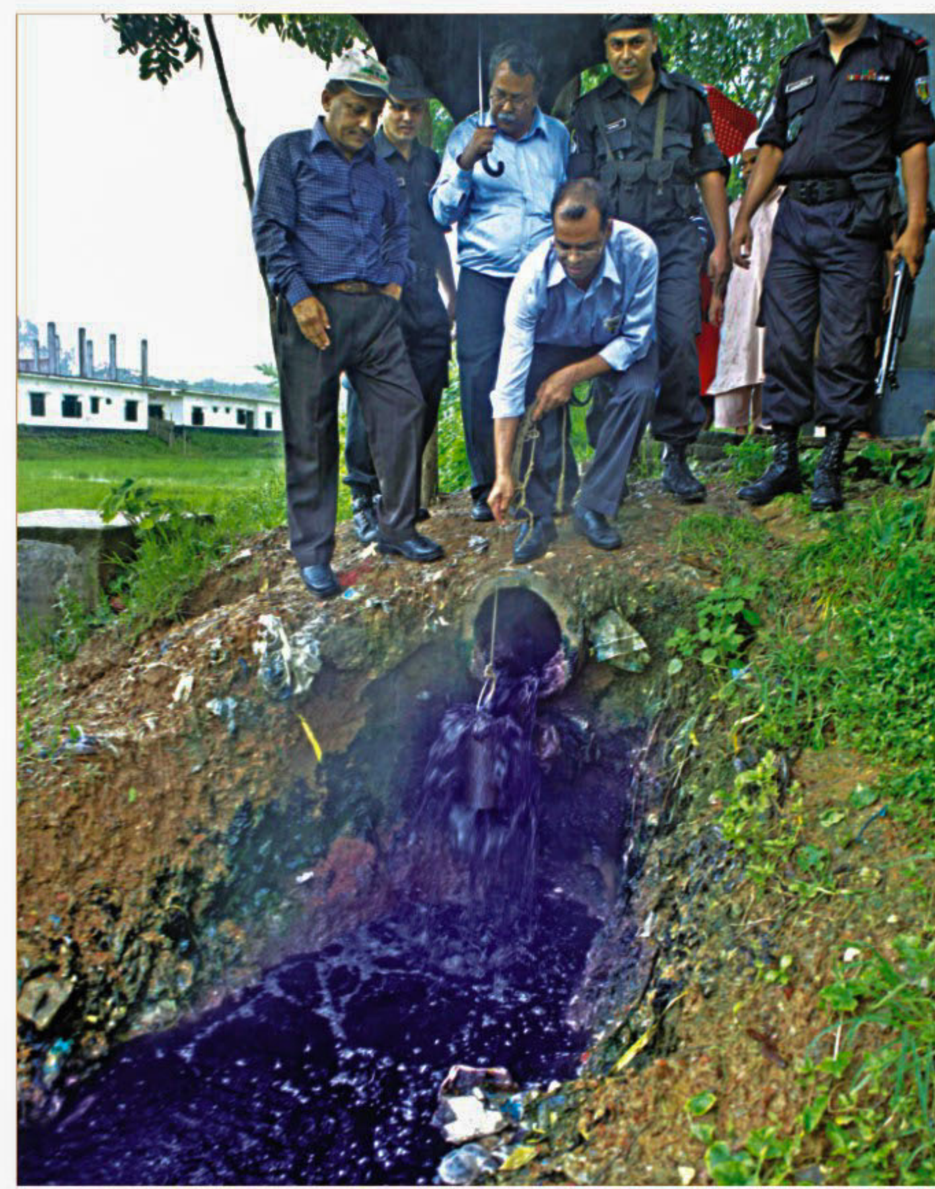
An official takes a sample of factory waste being dumped into a canal in Kaliakair. The Department of Environment fined four factories of Gazipur over Tk 1 crore for dumping untreated waste in the surrounding area.