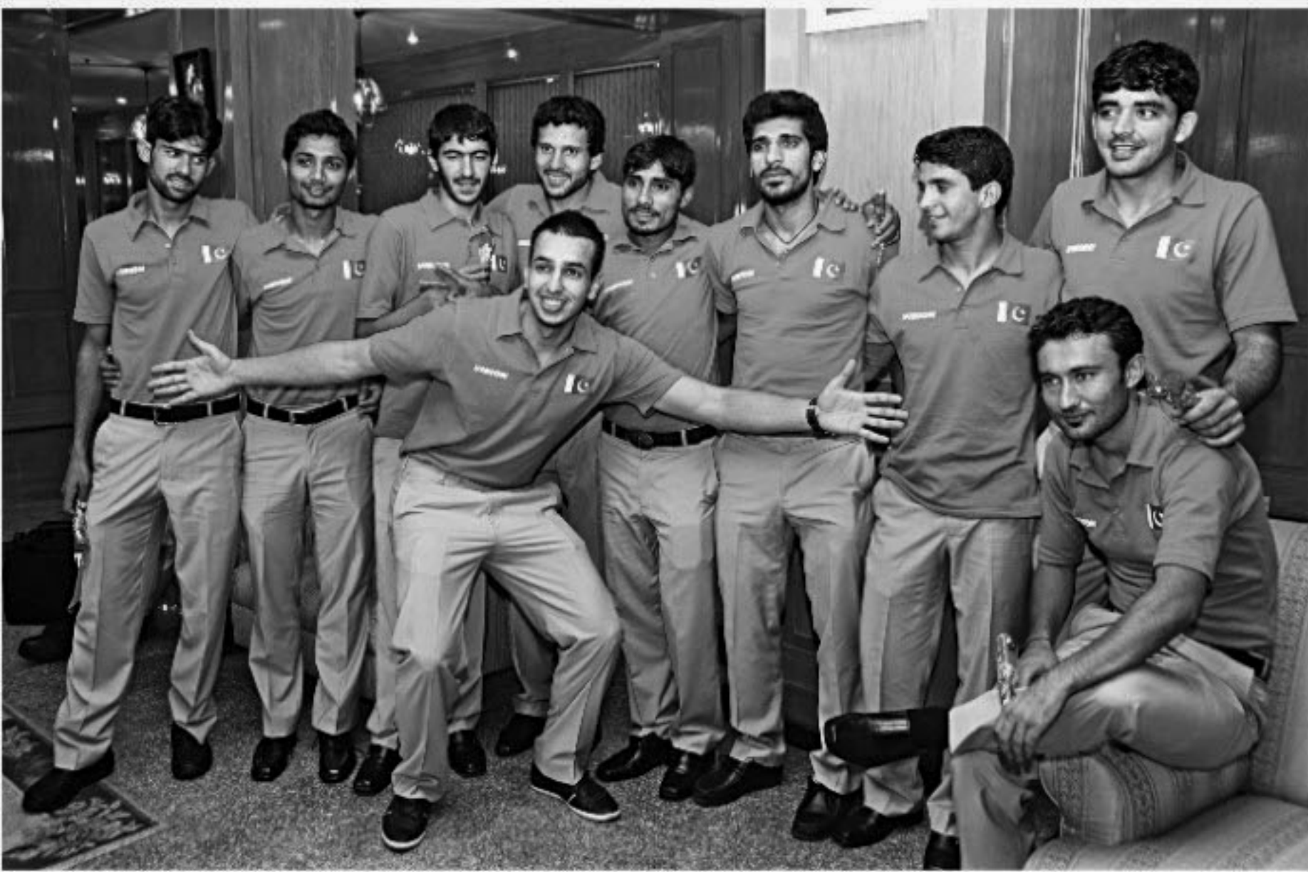
A cheerful Pakistan football team pose for photographs at a hotel in the city after their arrival yesterday. Pakistan will take on Bangladesh in the first of the two-legged World Cup pre-qualifiers at the Bangabandhu National Stadium tomorrow.