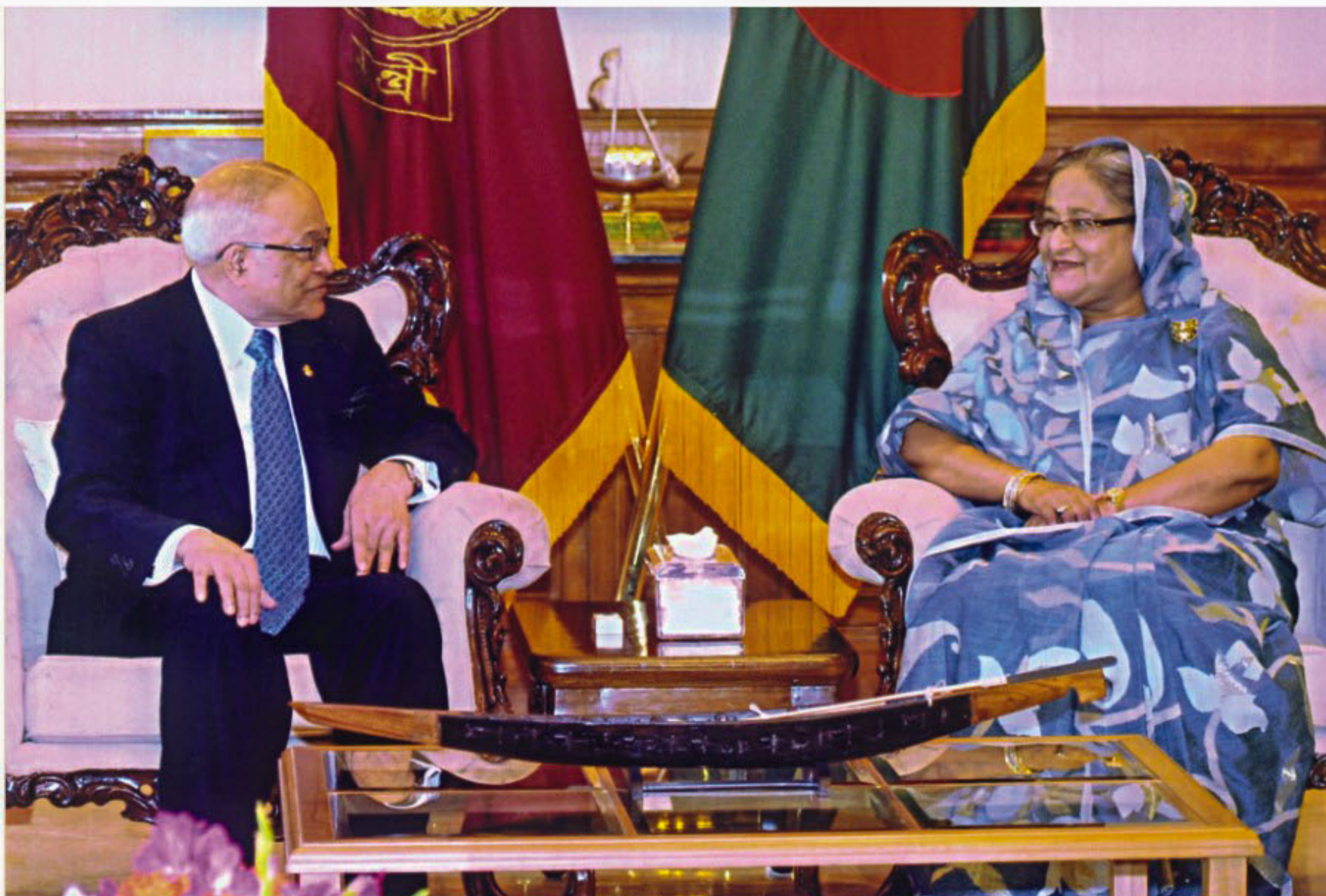
Mamun Abdul Gayoom, former president of the Maldives, pays a courtesy call on Prime Minister Sheikh Hasina at her official residence Gono Bhaban yesterday.

He will be laid to rest at his family graveyard in Ishwardi, Pabna. He left behind his four sons and four daughters.