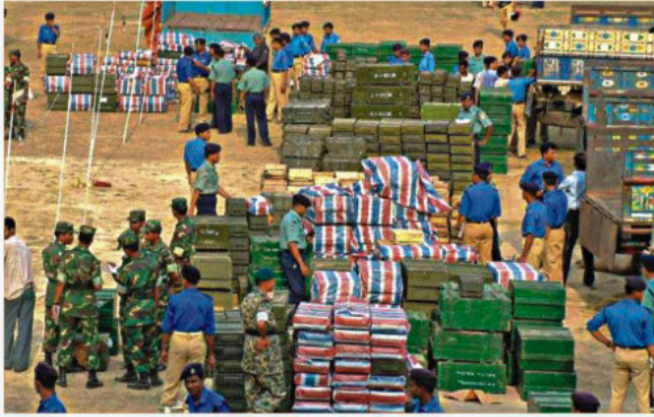
The 2004 arms haul...largest ever in Bangladesh.

Two cases were filed -- one for smuggling firearms and the other under the arms act -- a day after ten truckloads of