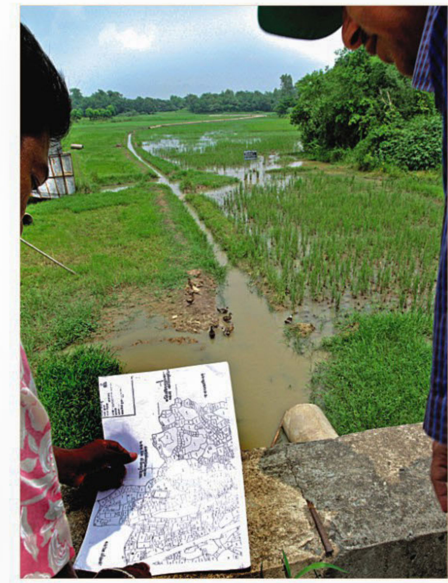
From a map, officials of Department of Environment identifying a canal which is earth-filled by a dyeing company for setting pipes of treatment plant at Birulia in Savar yesterday.