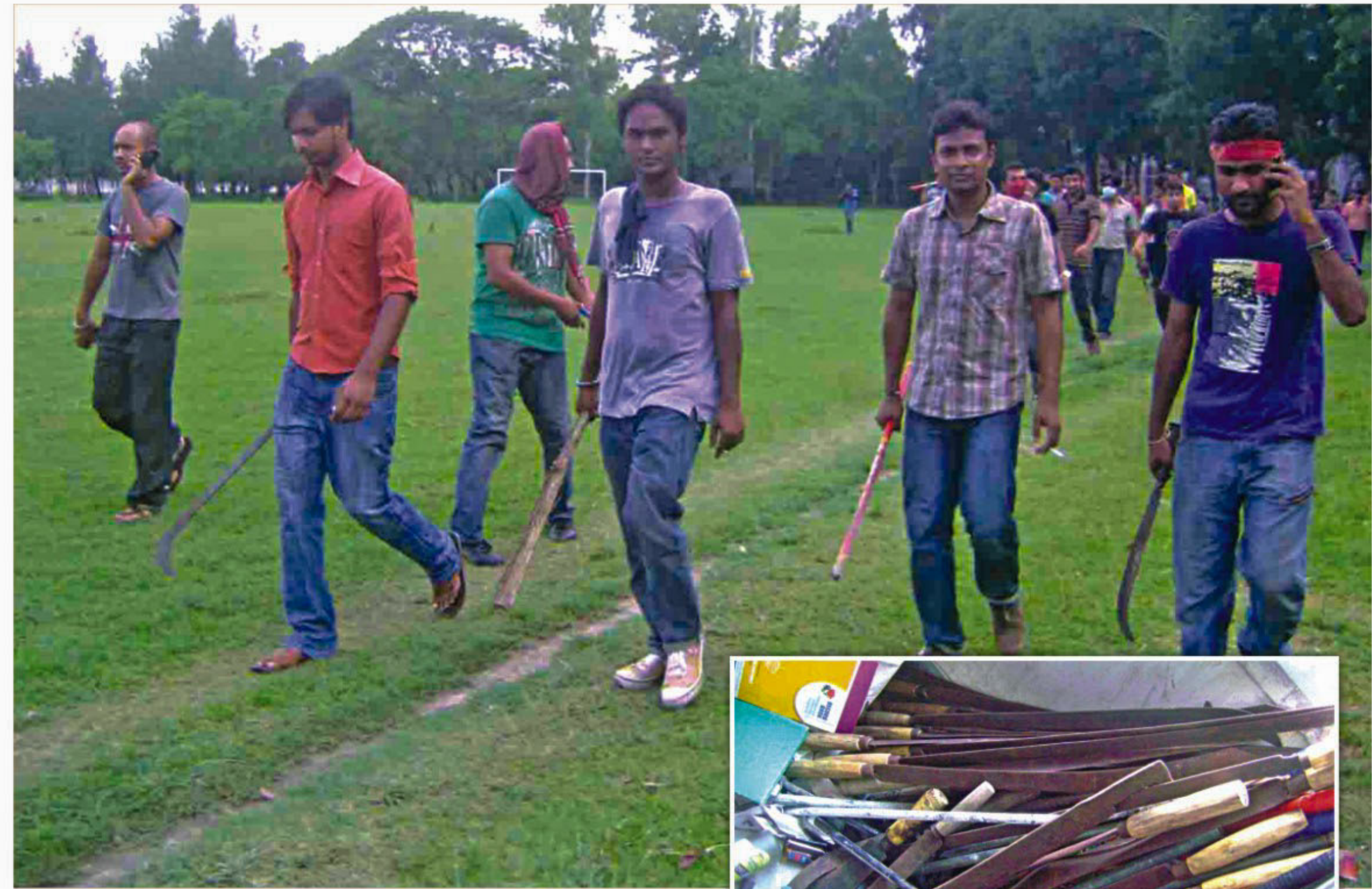
Activists of a BCL faction move to take on their rivals on Rajshahi University campus yesterday. Inset, weapons recovered from Bangabandhu Hall, a dormitory of the university.