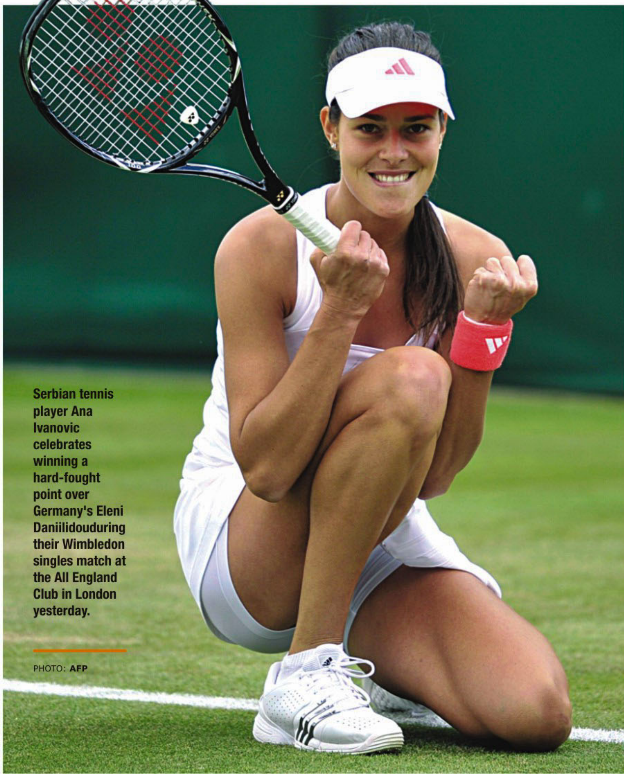
Serbian tennis player Ana Ivanovic celebrates winning a hard-fought point over Germany's Eleni Daniilidou during their Wimbledon singles match at the All England Club in London yesterday.