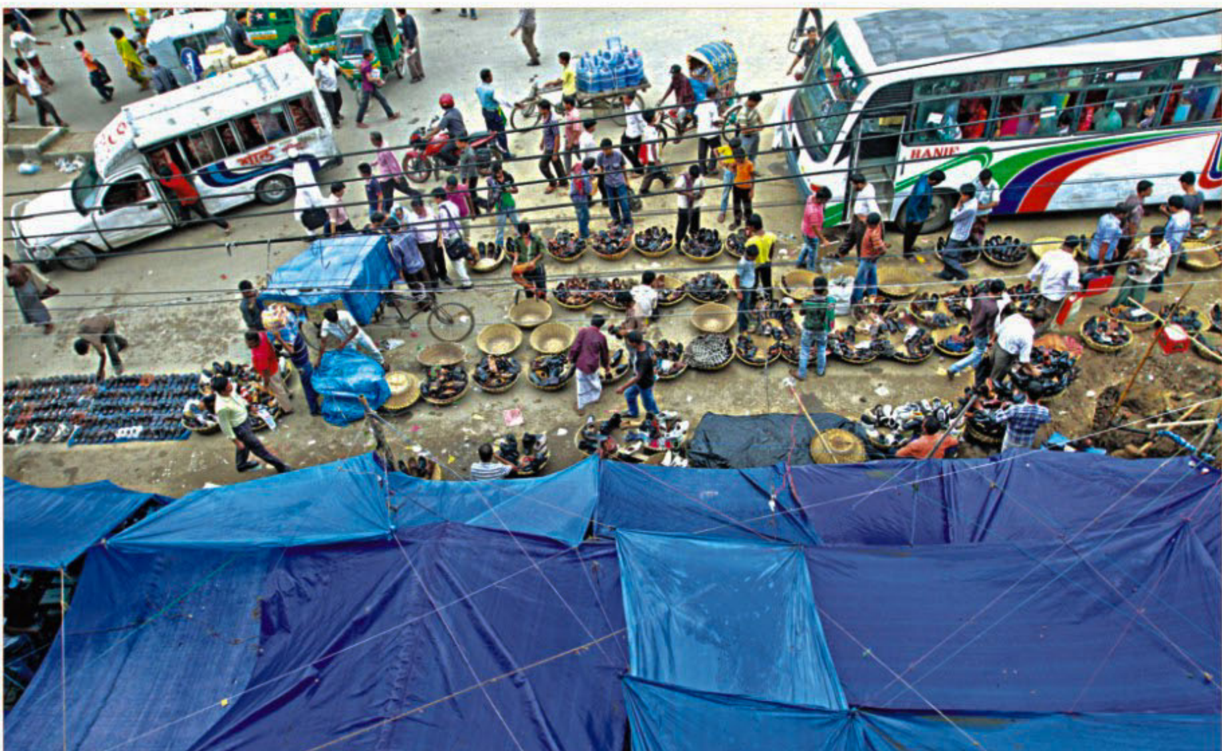
The authorities removed almost all illegal stalls from pavements in Dhaka city ahead of the cricket World Cup, but now they are back again with hawkers occupying even large sections of streets. The photo was taken from Gulistan area yesterday.

STAR REPORT The Malaysian government yesterday announced that illegal immigrants who come forward under an amnesty programme from next month will be fingerprinted. The amnesty will protect undocumented Bangladeshi workers alongside other foreign labourers, bringing a relief to the migrants facing threats of arrest and deportation. The programme, which will begin on July 11, will allow some of the immigrants to gain employment legally and others to leave the country without facing harsh punishments such as caning. Deputy Prime Minister Muhyiddin Yassin said not all of the illegal workers will be deported, adding that migrants who are needed by the local industries will be given documents to work legally, reports AFP. On May 16, the Malaysian home ministry in an announcement said it will regularise an estimated three lakh undocumented Bangladeshi workers alongside other foreign labourers. It will allow such workers to leave the country, if they want, without any penalty, the announcement said. SEE PAGE 19 COL 4