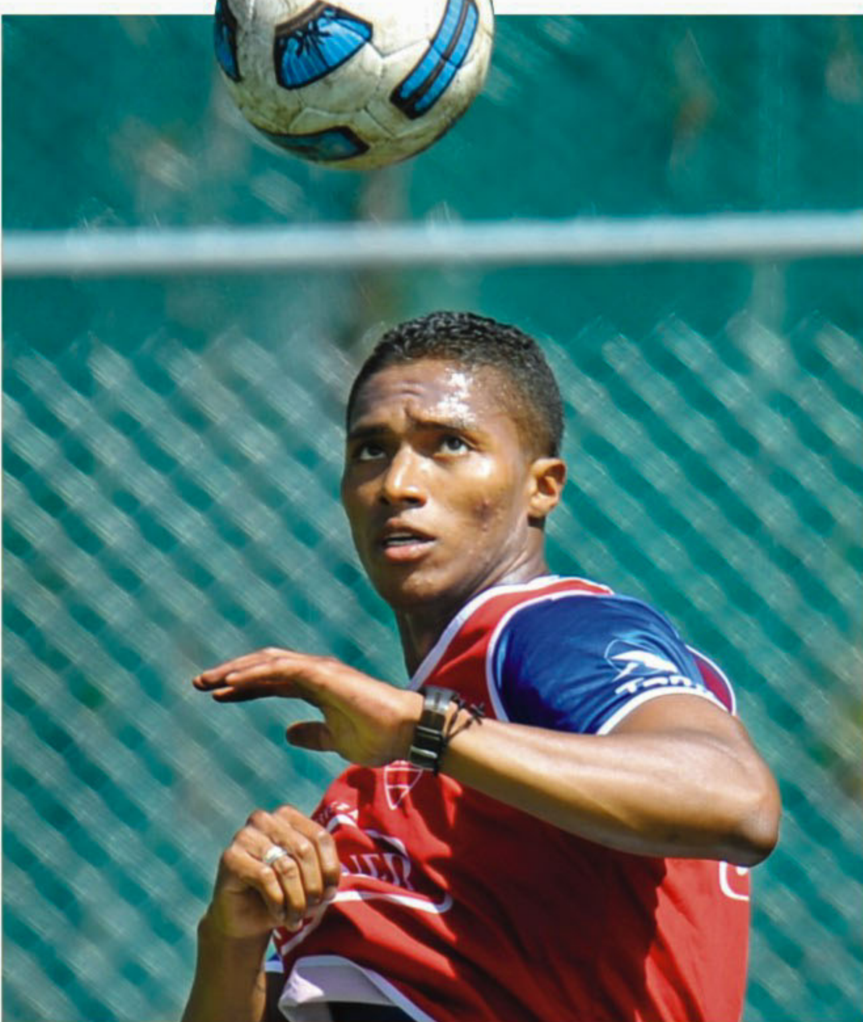
Ecuador winger Antonio Valencia practices headers during a training session in Quito on Tuesday.

Ecuador's best finish in the Copa is two fourth places achieved in 1959 and 1993 - they were hosts on the latter occasion.