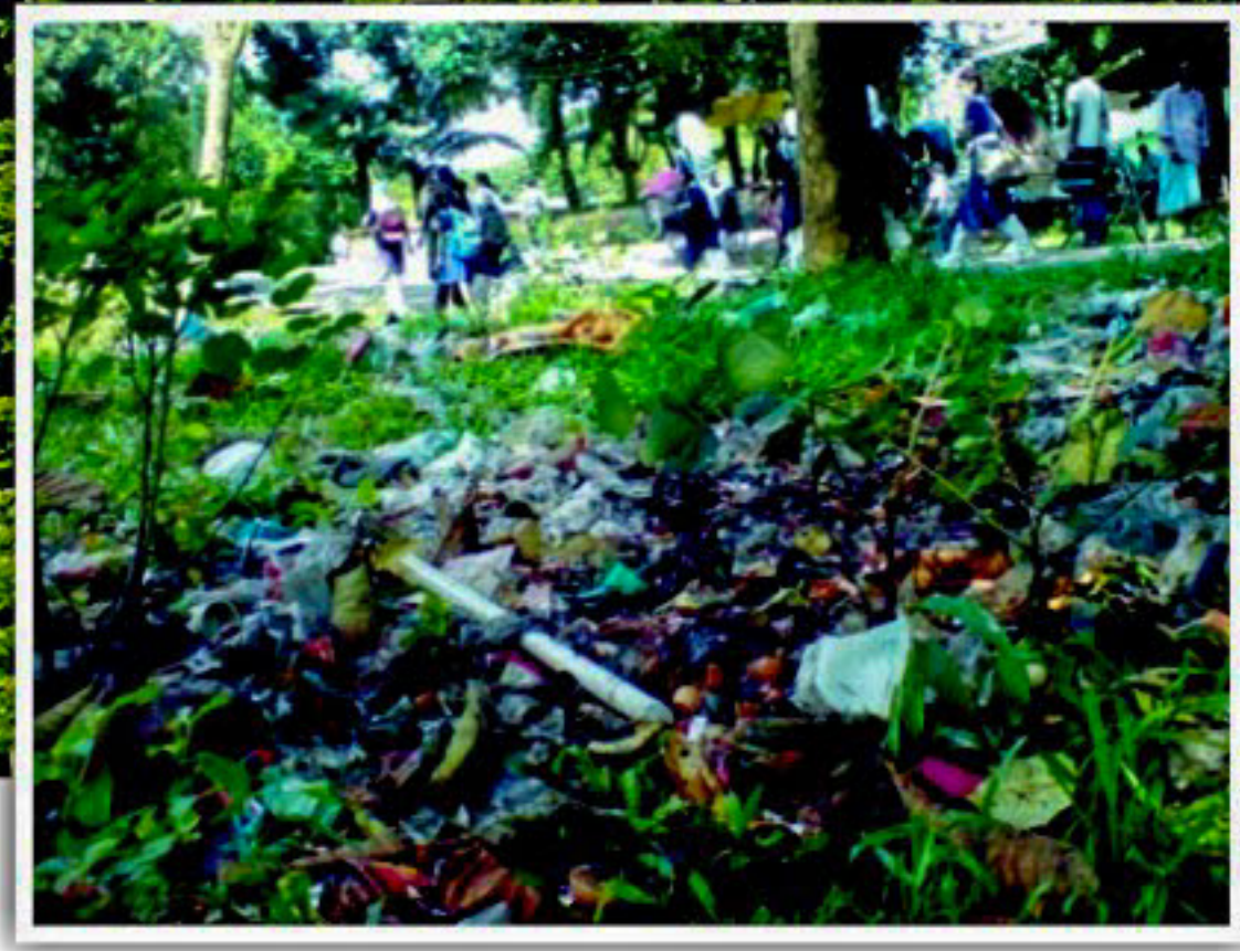
Chittagong University. Students walk past solid waste, inset, at 2 No Gate on the university campus.