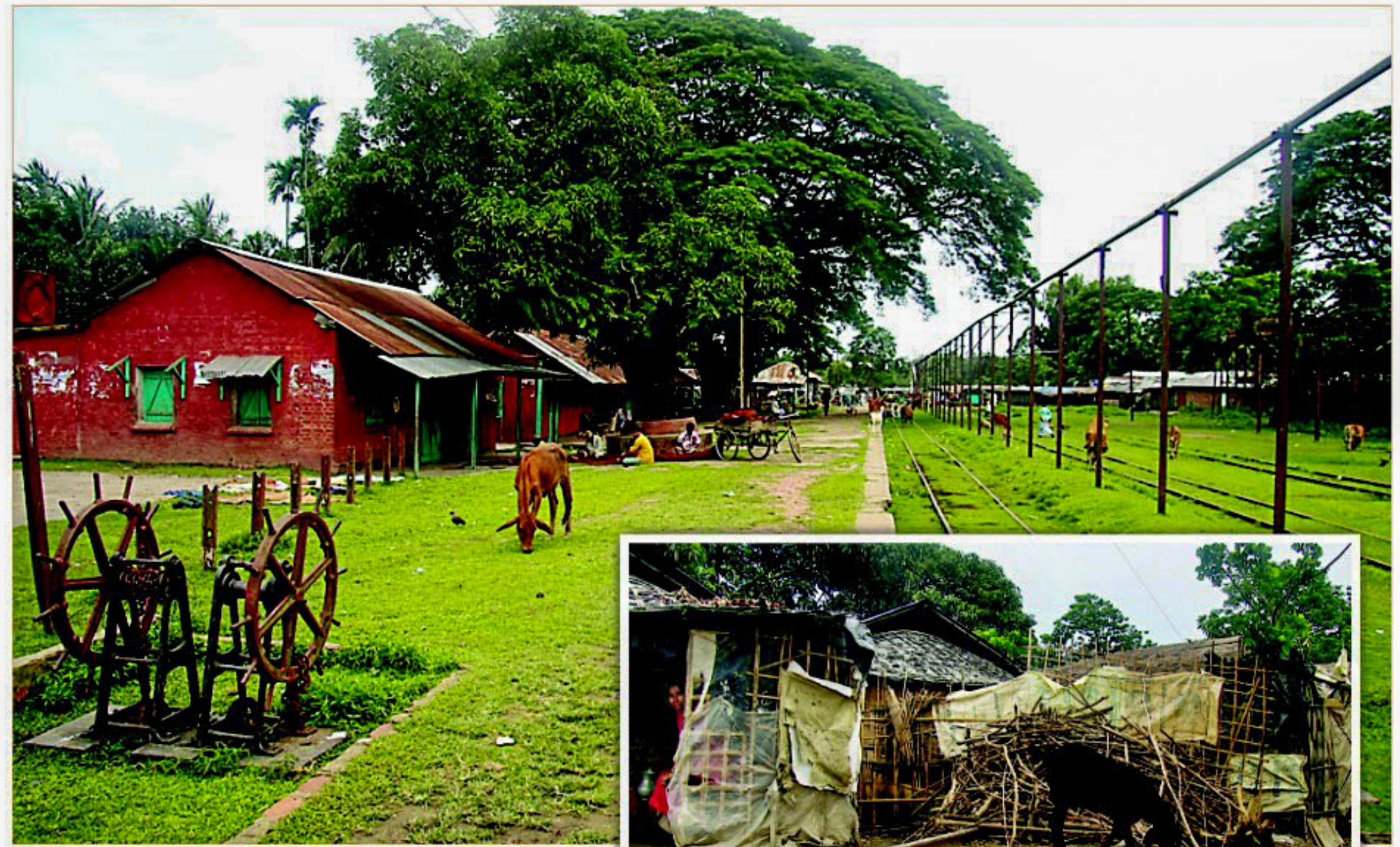
Dohazari railway station in Chittagong from where the construction work of Dohazari-Cox's Bazar rail line will start.

The Dohazari-Cox's Bazar rail line is a step to connect the country with the Southeast Asian countries through Trans-Asian Railway (TAR), the railway sources said.