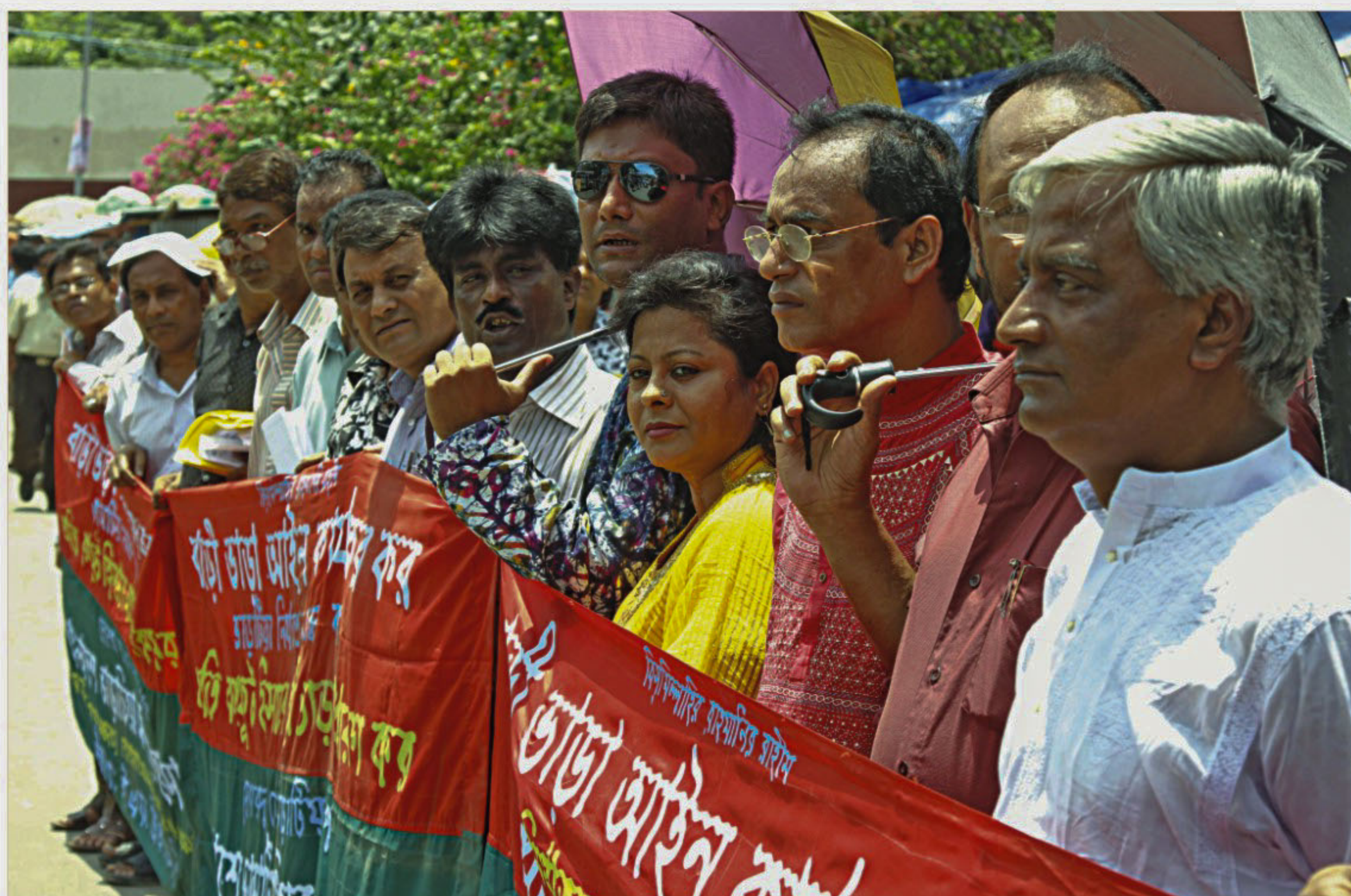
Bangladesh Bharatia Adhikar Sangrakkhan Society (society to protect tenants' rights) forms a human chain in front of Jatiya Press Club in the city yesterday demanding an end to oppression on tenants and to implement law to check house rent.