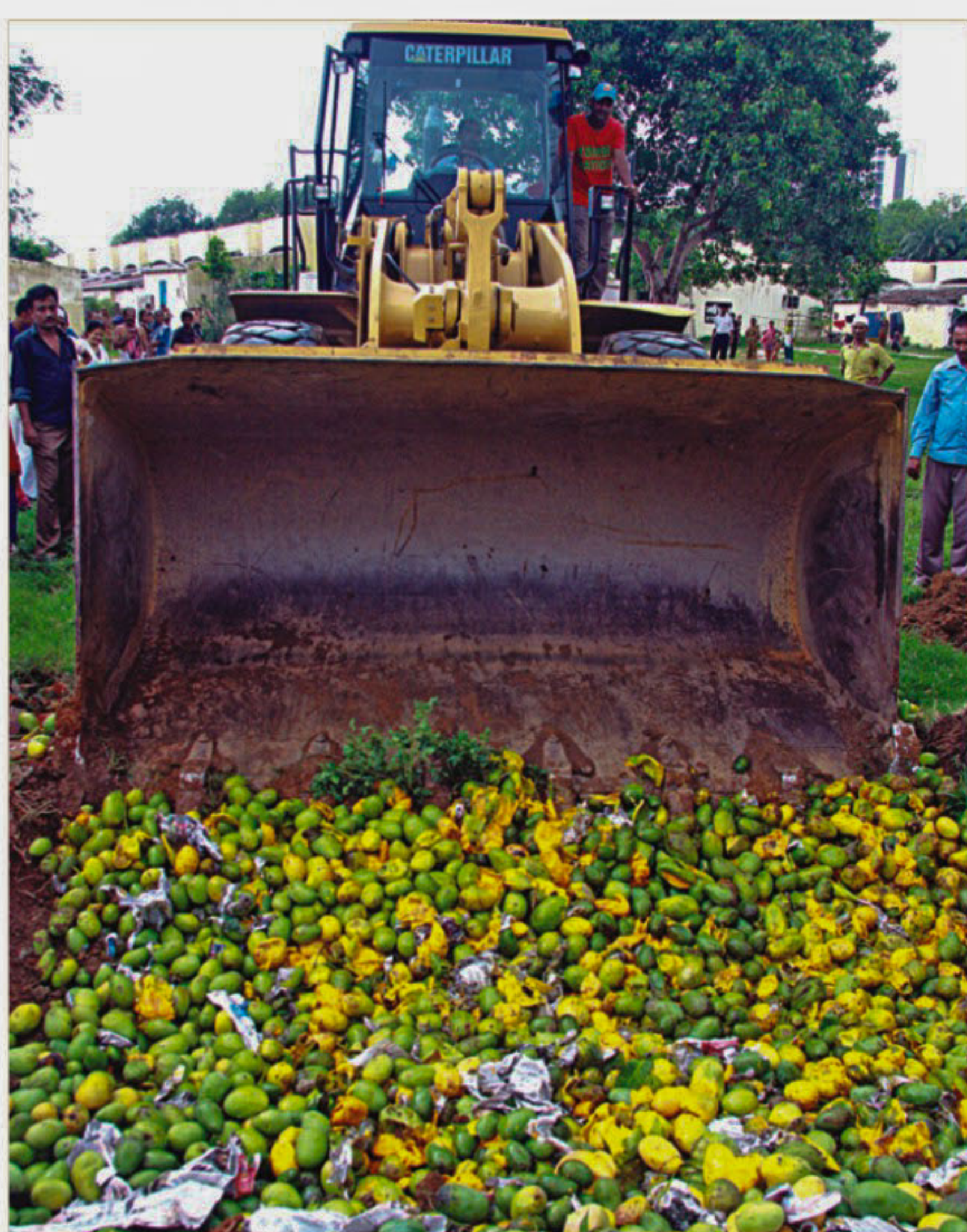
A mobile court of Dhaka City Corporation yesterday seized 100 maunds of chemically treated mangoes raiding different places in Mirpur and buried the fruits near Ganopurta Bhaban in Agargaon.

Both foreign ministers further agreed that Rabindranath Tagore's 150th birth anniversary would be jointly organised in China.