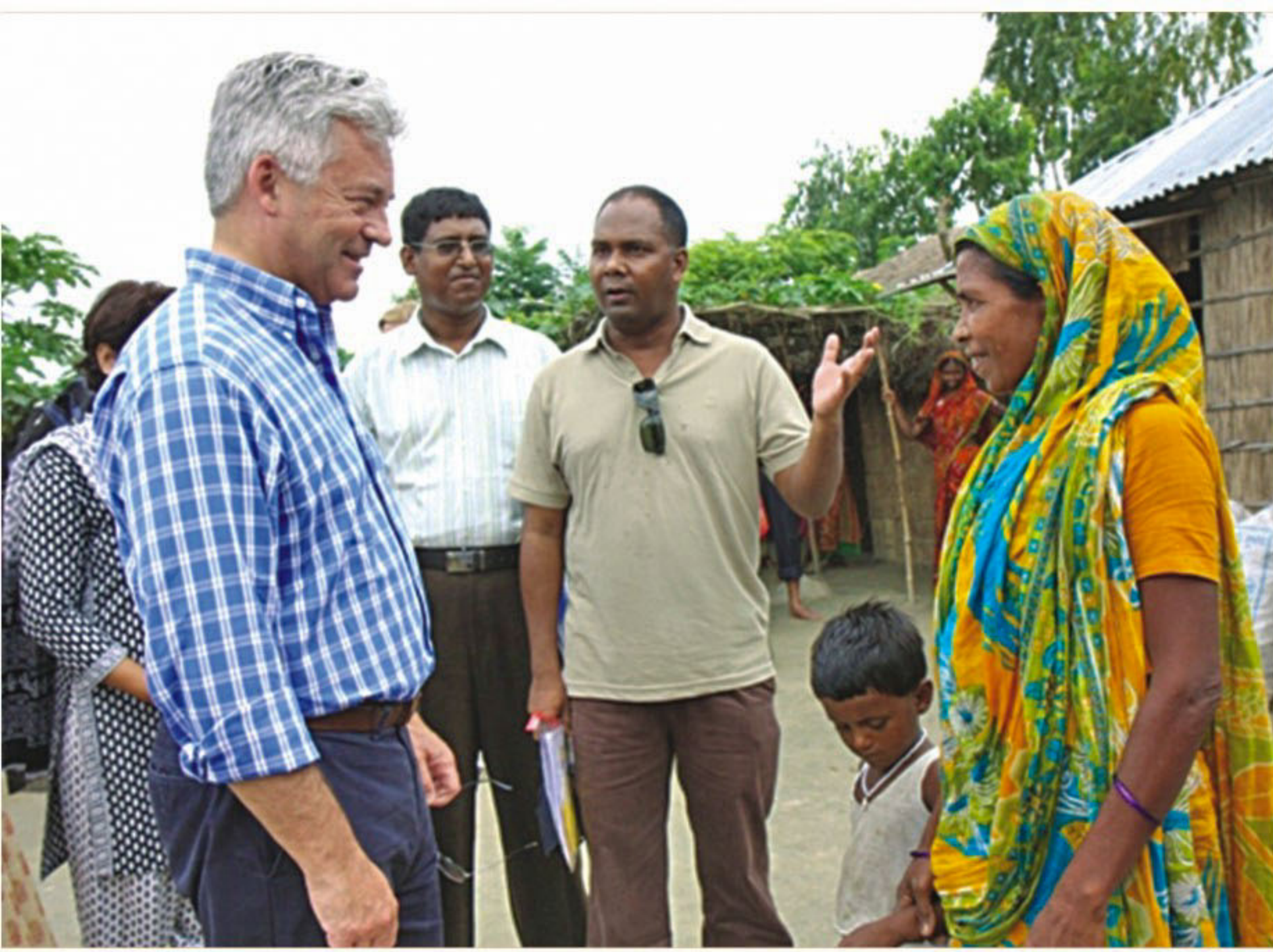
UK Minister of State for International Development, Alan Duncan, talks to a participant in DFID-funded project Char Livelihoods Programme (CLP) in Char Raidashbari village of Gaibandha yesterday.