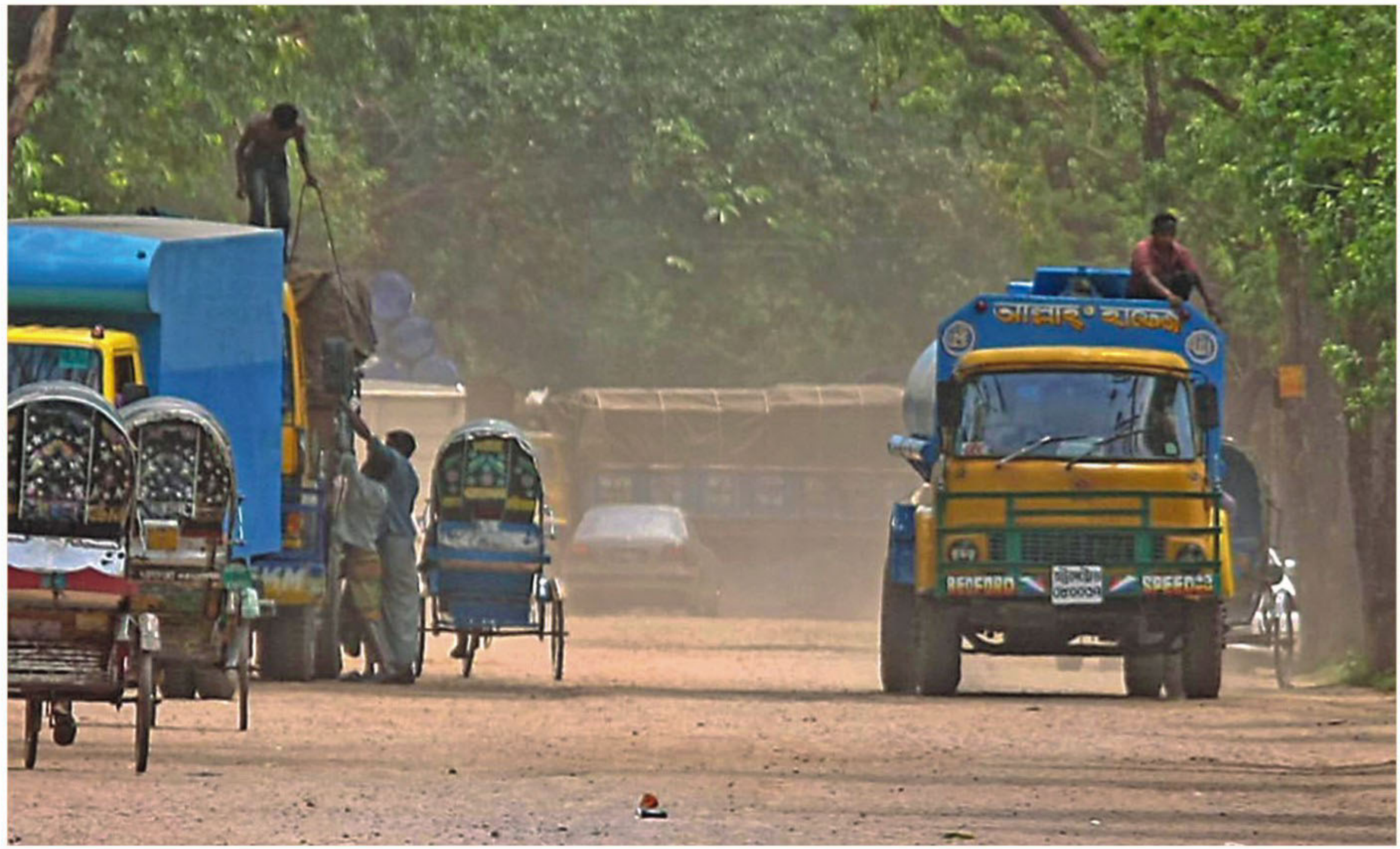
Dust clouding is common to the road long in disrepair in Kalurghat BSCIC industrial area of Chittagong city. The photo was taken yesterday.

He also had a courtesy call on Dinh Tien LE, vice minister of Science and Technology of Vietnam. They emphasised the mutual cooperation and exchange of experience and knowledge as both the countries are embarking on the path of nuclear energy.