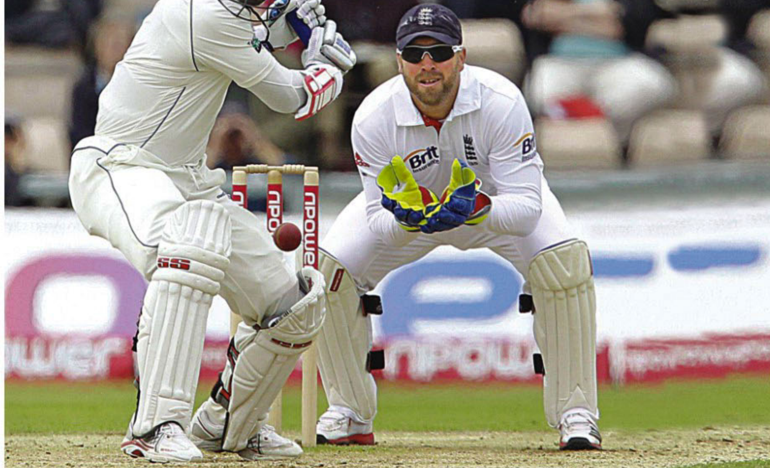
Sri Lanka captain Kumar Sangakkara shapes to cut a delivery during his match-saving century against England on the fifth and final day of the third Test at the Rose Bowl in Southampton yesterday.