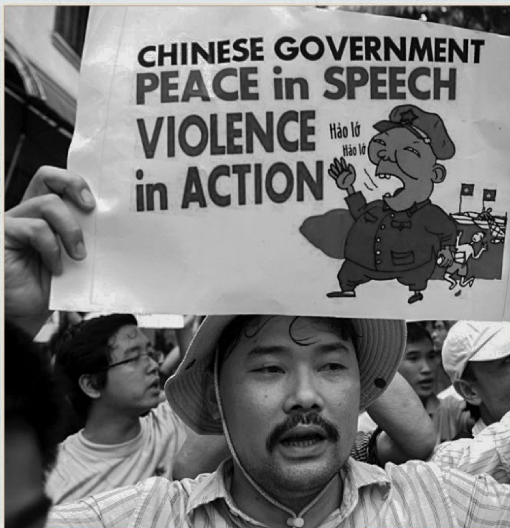
Protesters shout anti-China slogans and hold up placards as they march along a street near the Chinese embassy in downtown Hanoi yesterday as tensions between the two countries continue to simmer.