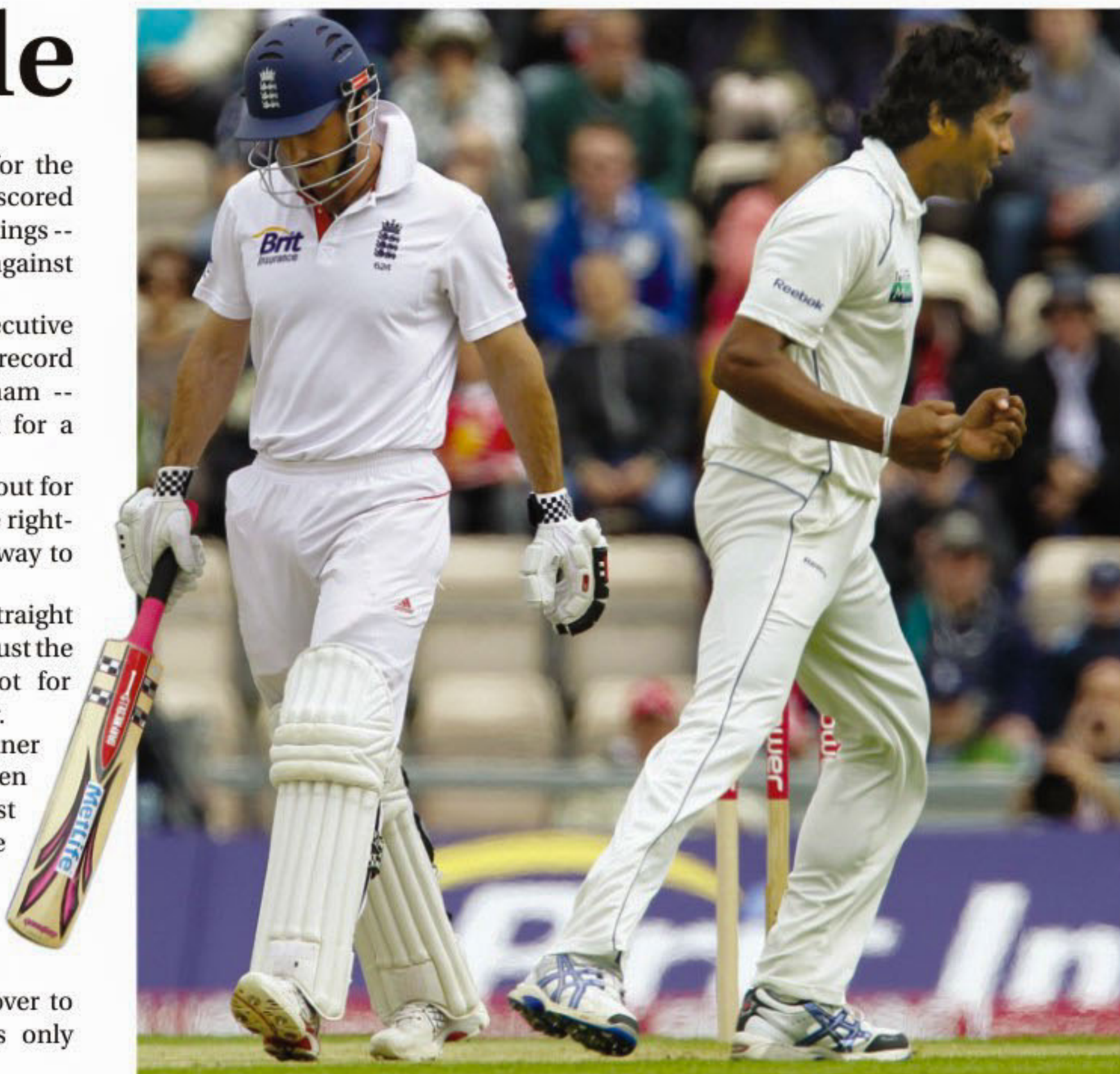
Sri Lanka's left-arm seamer Chanaka Welegedara snares England skipper Andrew Strauss (third time in the series) on the third day of the third Test at Rose Bowl in Southampton yesterday.