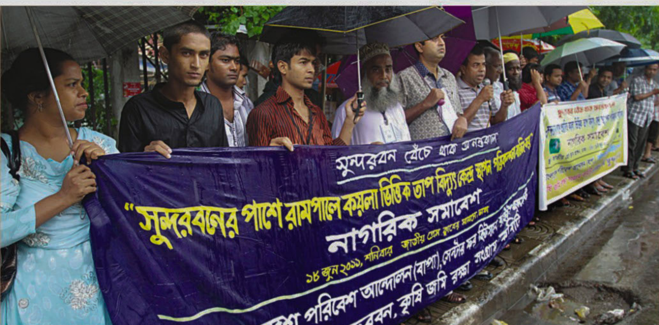
Some environmental organisations form a human chain in front of Jatiya Press Club in the city yesterday protesting the plan to set up a coal-based thermal power station in Rampal, an upazila of Bagerhat, next to the Sundarbans.