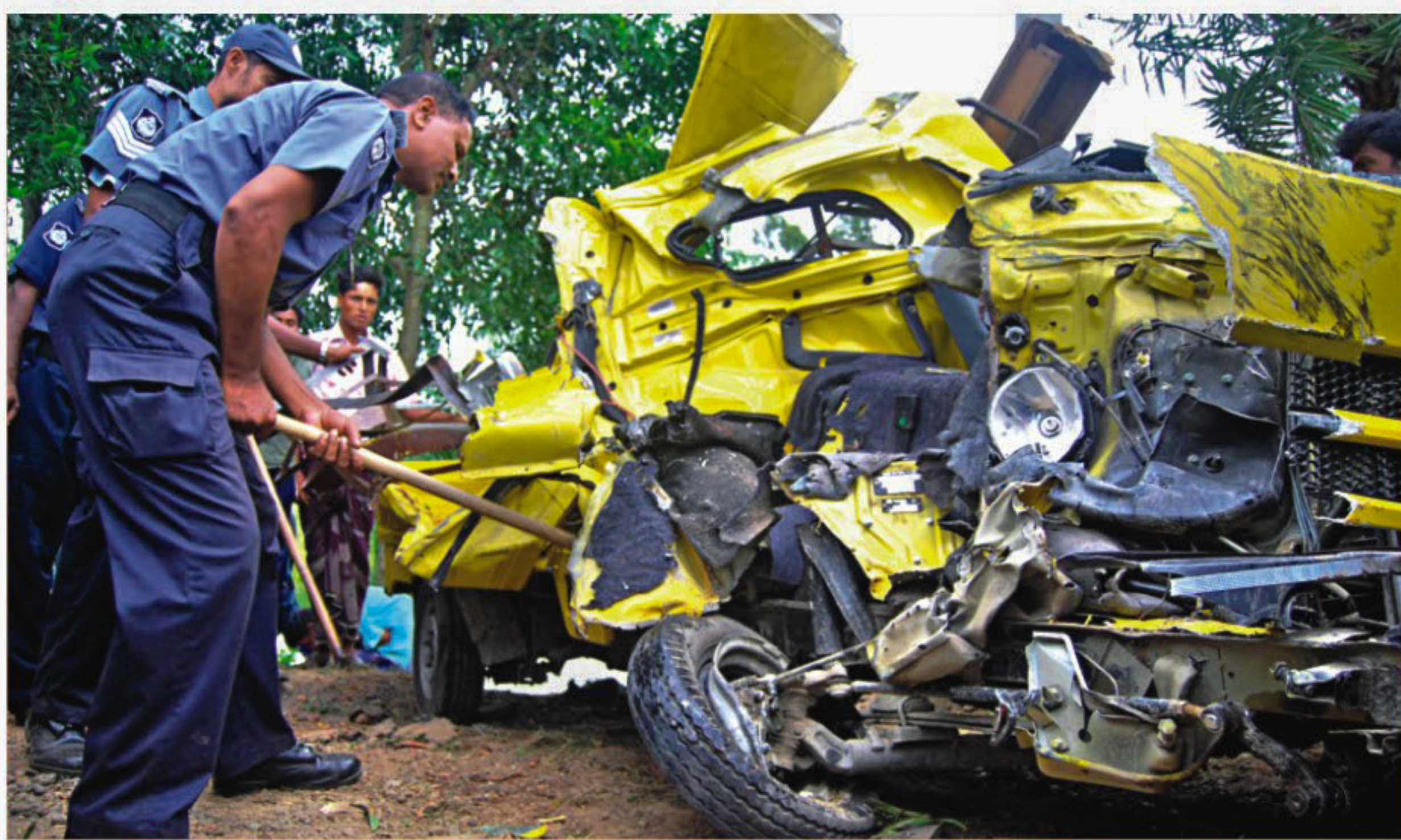
Police personnel inspect the mangled remains of the pick-up truck that was hit by a bus in Bogra yesterday.