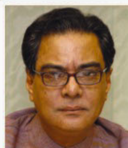
Syed Ashrafur Islam

"The next [parliamentary] elections will be held under