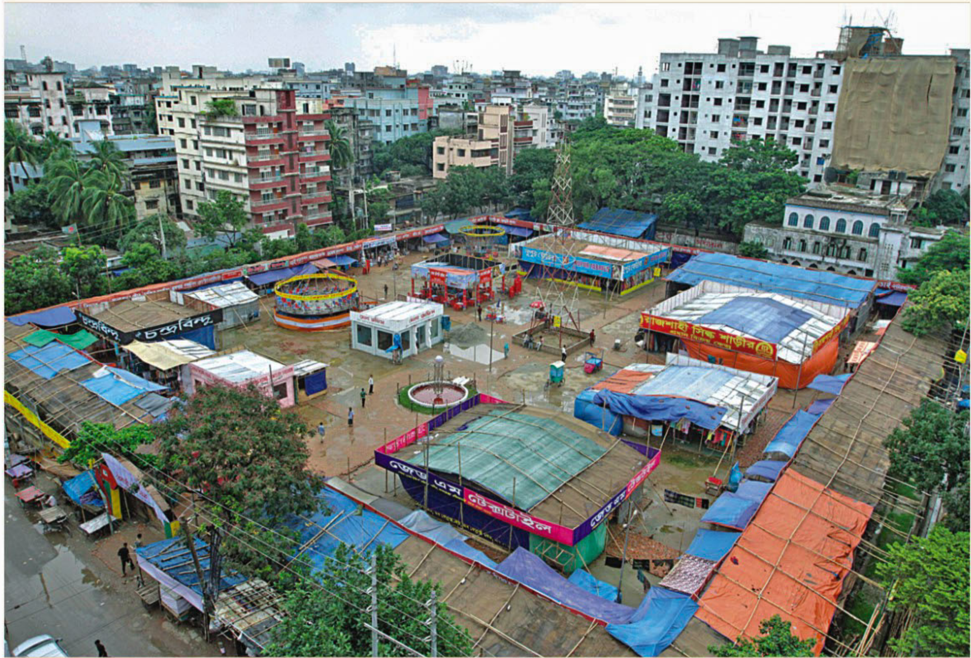
The only playground of the Madhya Bashabo area is turned into a fair venue for the cottage industry depriving the children of the ground for over a month. Locals say children do not even get their ground back in playable condition when fairs such as this one ends.