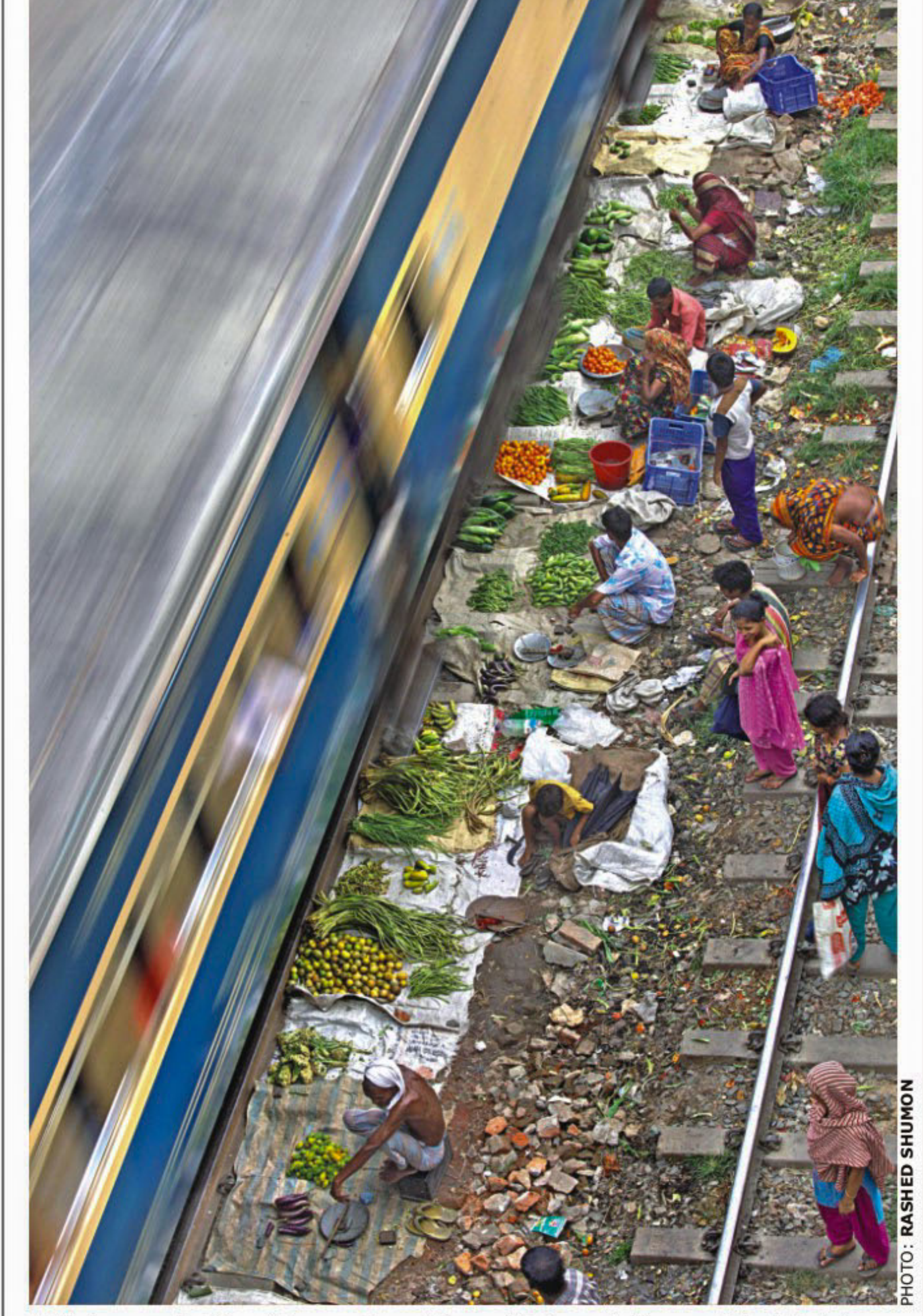
A kitchen market flourishes on the rail lines of Tejgaon in the capital while inter-city trains whizz by. The railway and the Dhaka City Corporation seem to care little about the risky business going on in the slum-dominated area.

STAR REPORT Five more persons have been infected with anthrax in Sirajganj and Pabna districts, upazila health office sources confirmed yesterday. Our Sirajganj correspondent reports: Four persons -- Abdul Momin, 35, Marium, 60, Hazera, 65, and Sabina, 25, -- of Char SEE PAGE 19 COL 4