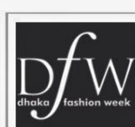
Fashion Photography Exhibition Venue: University of South Asia, Banani Date: June 15-18 Time: 10am-9pm