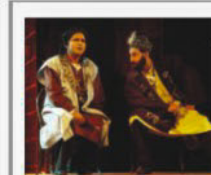
Theatre Festival Organiser: Bangladesh Group Theatre Federation Venue: Shilpakala Academy Date: June 3-17 Time: 7pm everyday