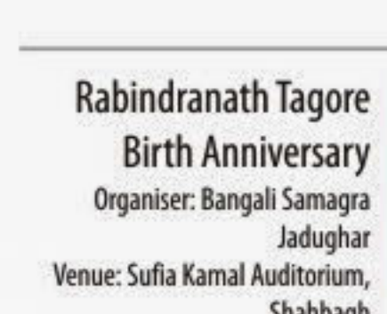
Rabindranath Tagore Birth Anniversary Organiser: Bangali Samaga Jadhugur Venue: Sufia Kamal Auditorium, Shahbagh