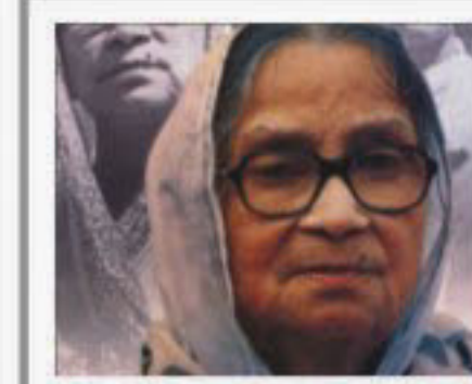
Sufia Kamal Birth Anniversary Venue: Chhayanaut Auditorium Date: June 17-18 Time: 6:30pm