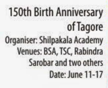
150th Birth Anniversary of Tagore Organiser: Shilpakala Academy Venues: BSA, TSC, Rabindra Sarobar and two others Date: June 11-17