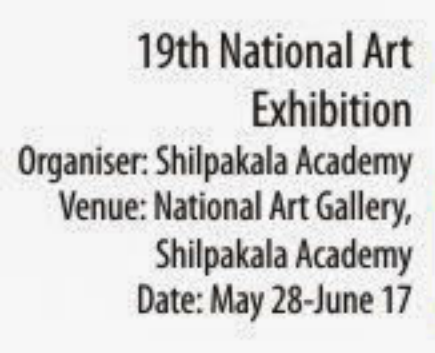
19th National Art Exhibition Organiser: Shilpakala Academy Venue: National Art Gallery, Shilpakala Academy Date: May 28-June 17