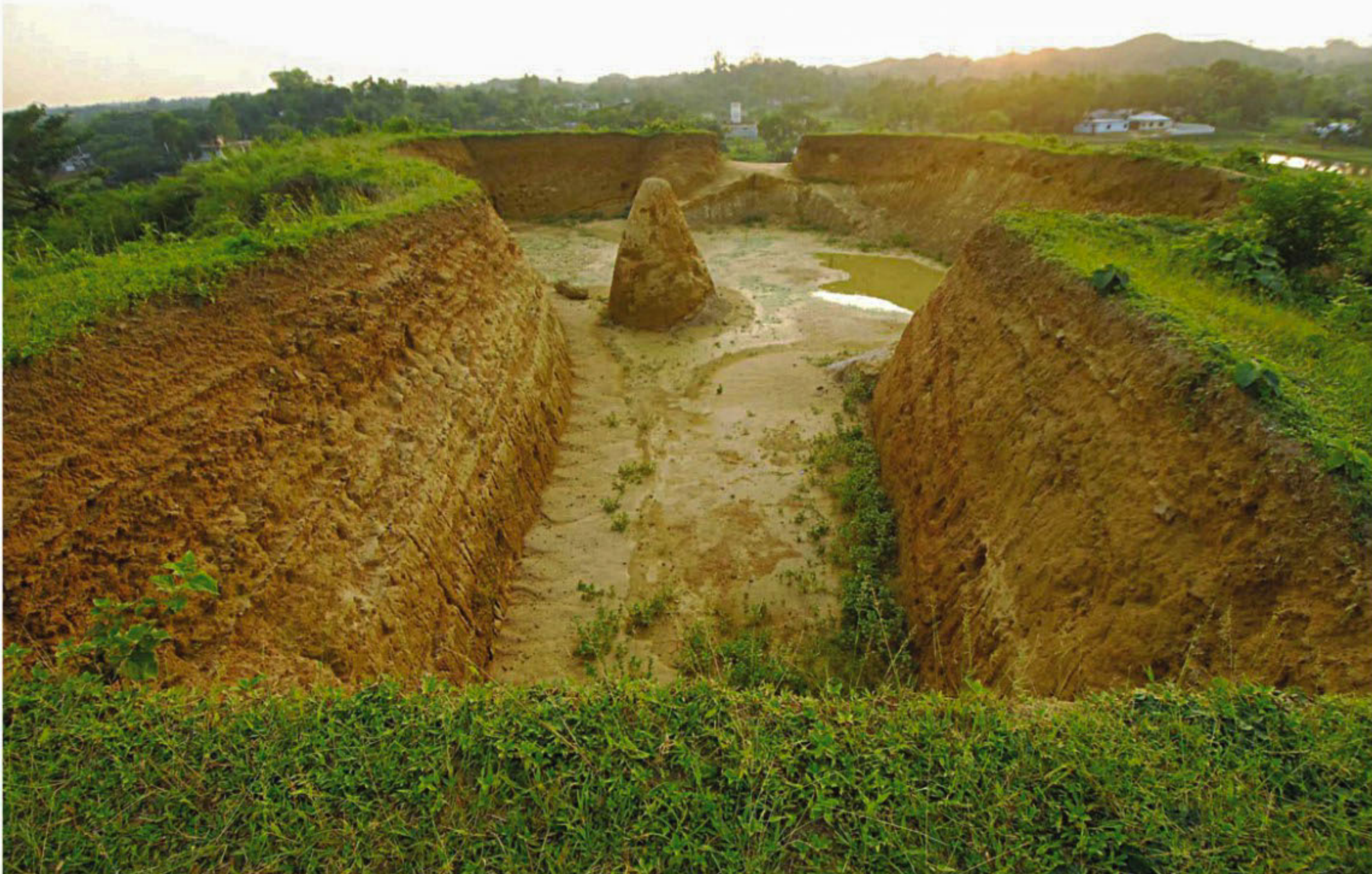
The pond was purposefully excavated at the top of a hillock, locally known as "Moloy tila", in Khadimpara, a suburb of Sylhet city, to evade law against illegal hill cutting.