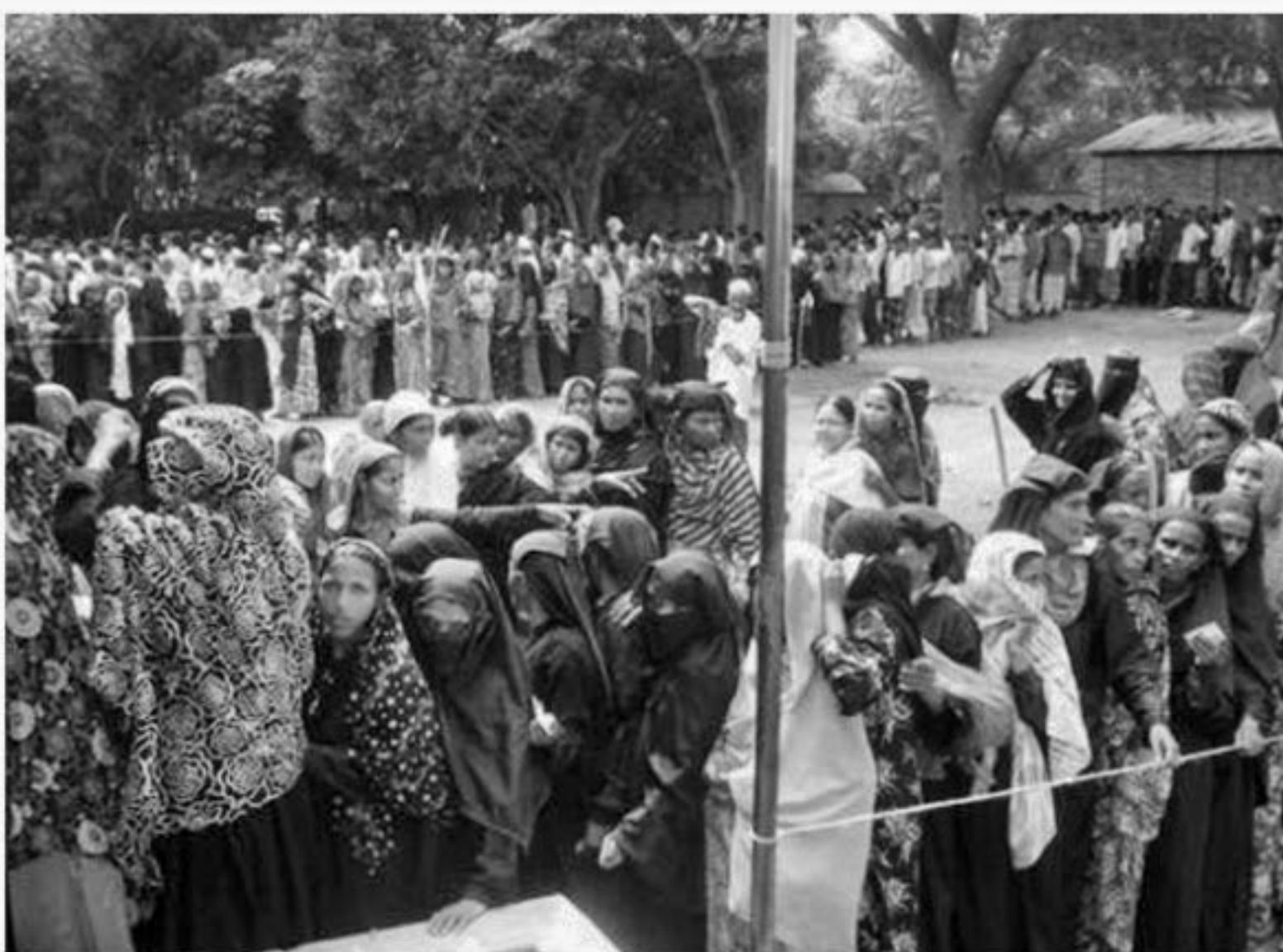
Voters in long queues in the scorching heat at Nalbhatta polling centre in Raipura upazila of Narsingdi district wait for their turn during the union parishad election yesterday.