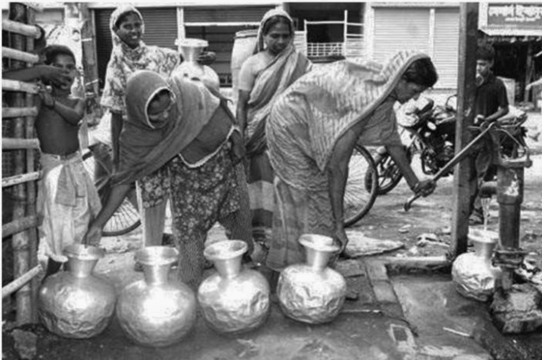
Women and children gather to fetch water from a roadside tube-well at Shelkhpura in Khulna city. Wasa's failure to supply adequate water through pipelines makes a large number of city dwellers dependent on such tube-wells.

police team will assist a high-powered team of officials to face any unwanted situation, he said. Earlier on April 13, Khulna Wasa launched a similar drive but it had to be suspended four days later amid angry protests from subscribers who blasted Wasa's failure to meet their water requirement. A sum of Tk one crore 28 lakh 60 thousand and 592 has fallen arrear to government and non-government organisations of Khulna city while the total amount of outstanding bills to around 15,000 subscribers now stands at Tk 2 crore 28 lakh and 39,408, according to official sources of Wasa. With outstanding bills of Tk 17 lakh 44 thousand and 425, Khulna Development Authority remains the highest defaulter, followed by Division-2 of Khulna PWD (Tk 17 lakh 35 thousand and 126) and the Office of the Khulna Divisional Commissioner (Tk 11 lakh 18 thousand and 480).