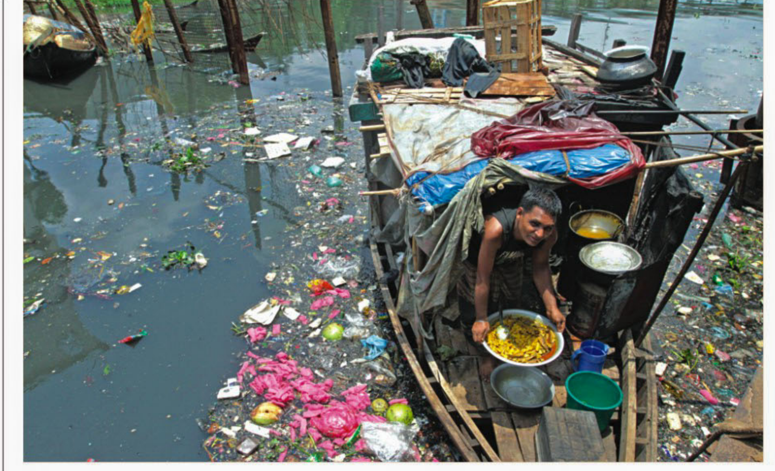
Hard to believe this is a takeaway. The food is cooked in this very boat anchored at Sadarghat in the capital with garbage floating on the filthy water. The photo was taken yesterday.