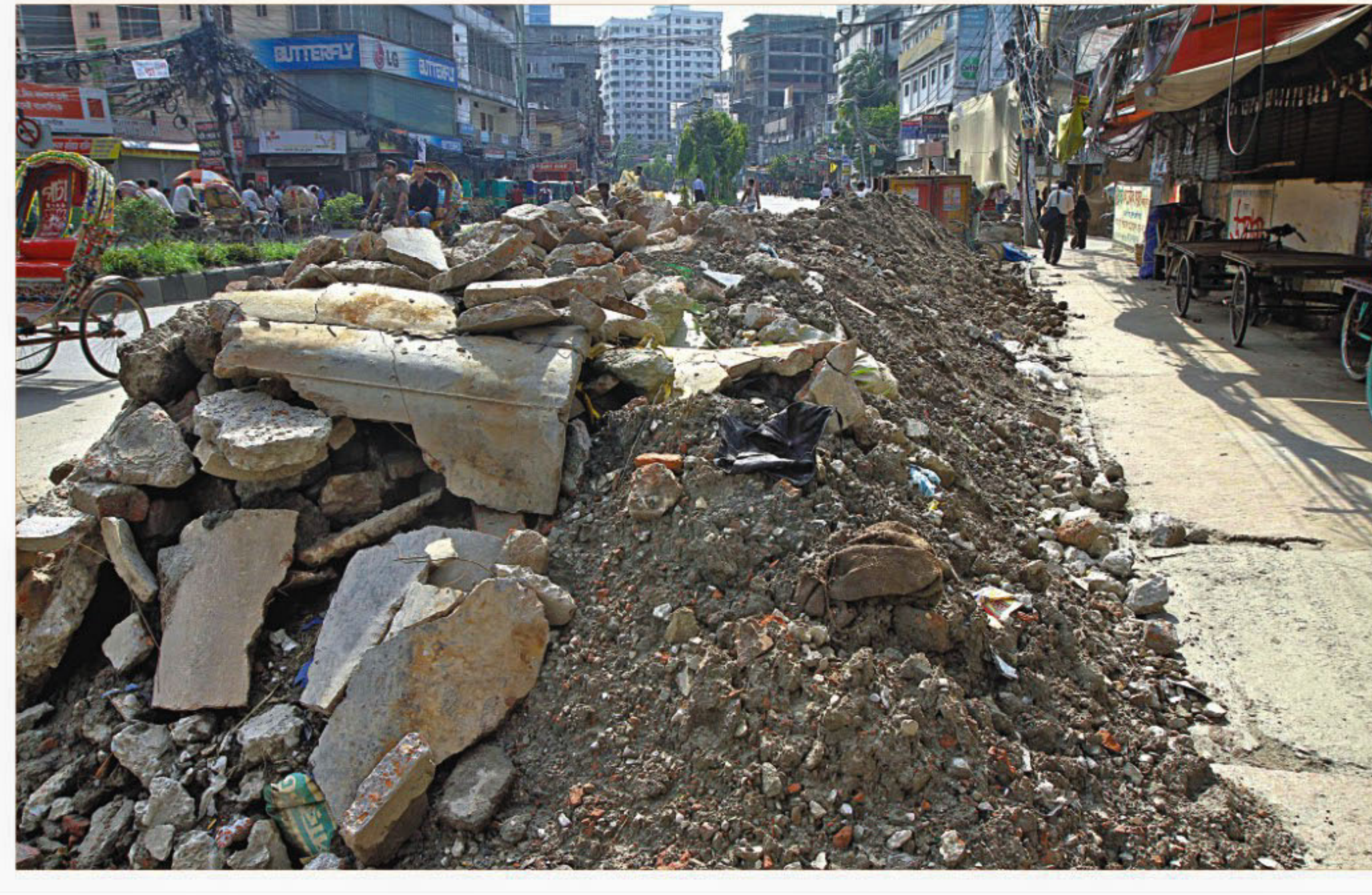
A pile debris of a demolished building is left along the pavement beside a skip for the DCC garbage collectors to pick up. The rubble has been occupying the road at Moghbazar Wireless for over a week.

STAFF CORRESPONDENT Mobile court operation during the 36-hour hartal from Sunday dawn has sparked controversy among different quarters as around 113 hartal pickets were convicted for the first time during the countrywide shutdown called by the opposition. A number of lawyers and eminent persons said conviction of pickets during hartal is totally unlawful, raising questions about the way the courts were conducted. Barrister Rokanuddin Mahmud said the proceedings of the mobile courts during the hartal were not transparent. A mobile court requires at least two witnesses to convict a person and even the magistrate conducting the court needs to witness the offence, he said. It is not clear whether the convicted persons made confessions in panic or the police forced them to do so, Mahmud said. He heard that many passersby were victim of the mobile court action. No court can convict anybody on SEE PAGE 19 COL 1