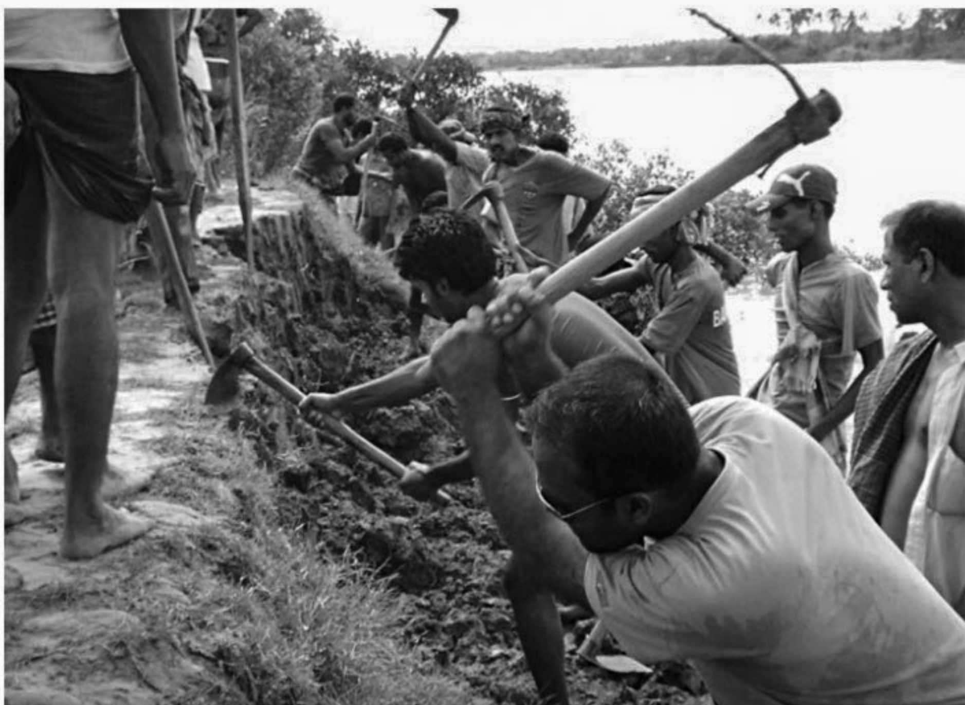
Locals dig a char (newly emerged landmass) area on the Bhairab River at Chanpatala Rahimabad in Bagerhat Sadar upazila to divert the flow to save Jatrapur, Babuipara and Bishnupur unions from flooding, right , the grand initiative gives some people the opportunity to catch shrimp from an illegally developed shrimp enclosure on the khas land in the char.