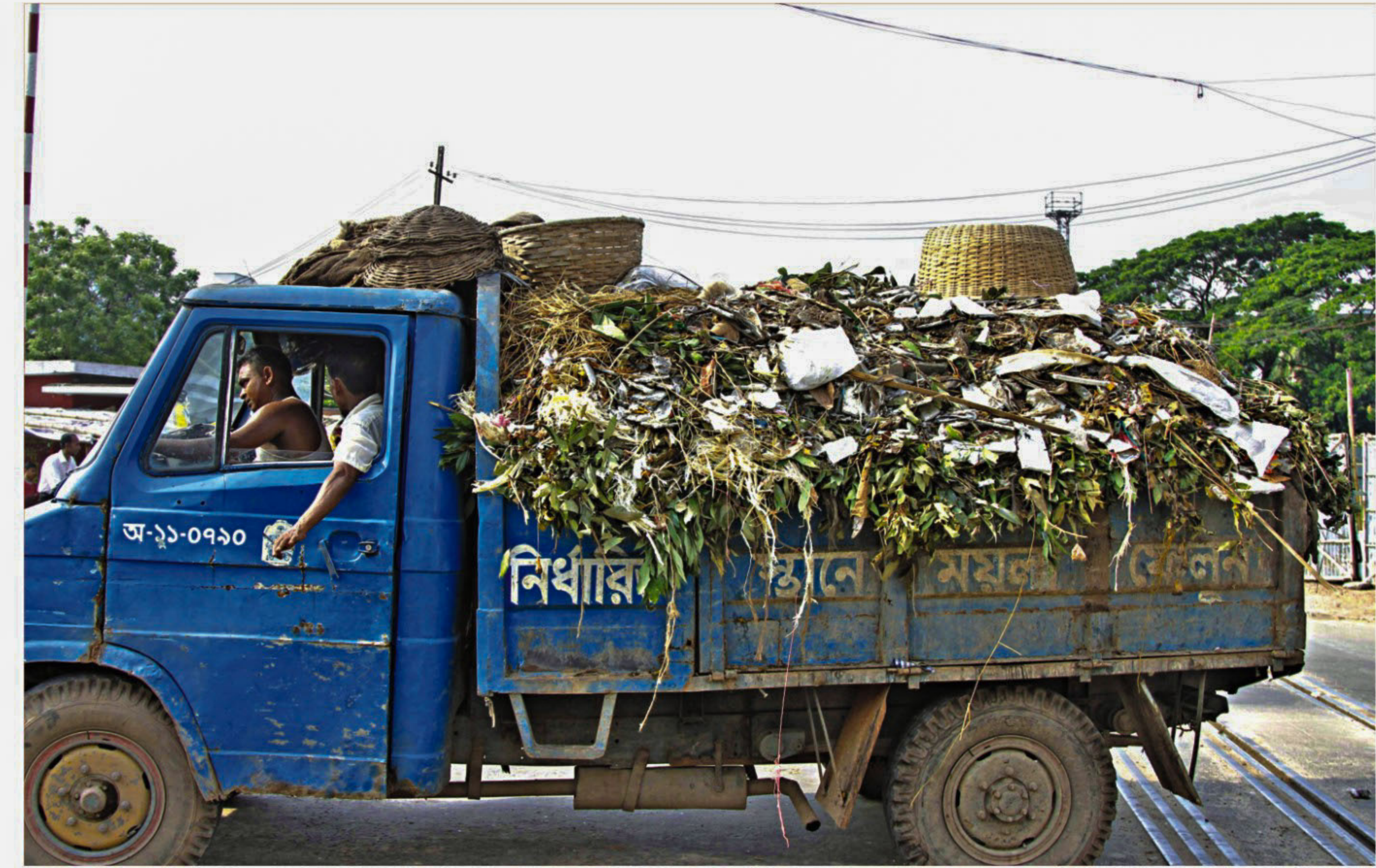
Flouting Dhaka City Corporation rules, its garbage truck carries waste during the daytime and without any covering at Kamalapur in the city yesterday, spilling waste and spreading stench all around.