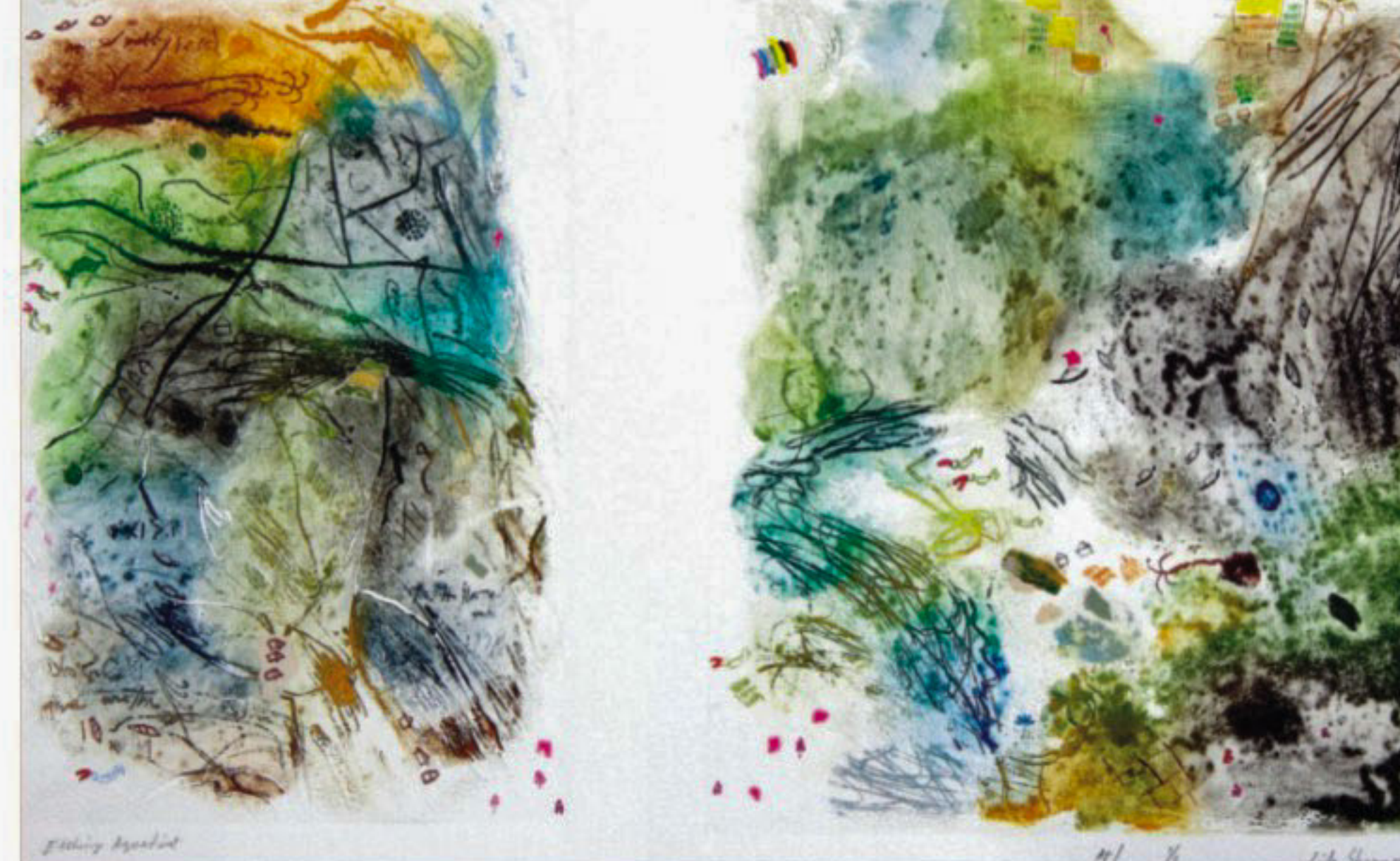
Datta Dayadhvam Damyata: Shantih Shantih Shantih-1 (etching)

Hiratsuka (Japan). The Space International Print Biennial commenced in 1980 with the motto 'Small is Beautiful'. The event, aimed to discover promising print artists from around the world, seeks to pursue cultural potential for the art of print to be integrated more easily into people's daily lives.