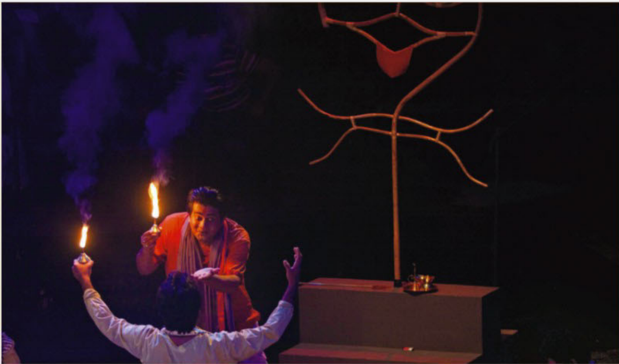
"Nishimon Bisharjan" is a statement against religious extremism in a contemporary setting.