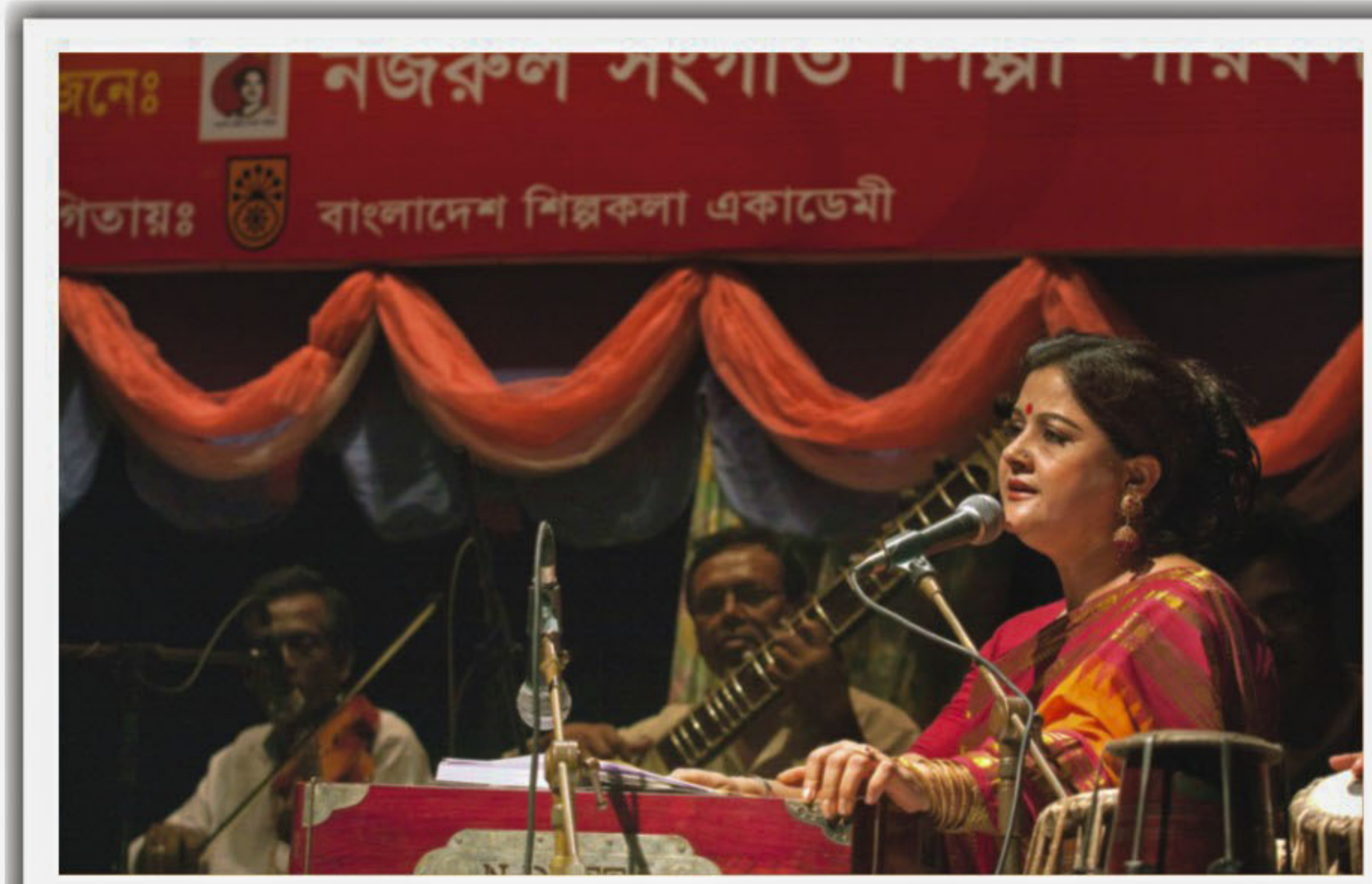
Nazrul Sangeet Shilpi Parishad in association with Bangladesh Shilpakala Academy has arranged a five-day Nazrul Utshab (festival) at National Music and Dance Centre auditorium of BSA. Starting from June 5, the festival celebrates 112th birth anniversary of the National Poet. On the second day (June 6), artistes from different districts, alongside renowned singers, performed at the festival.