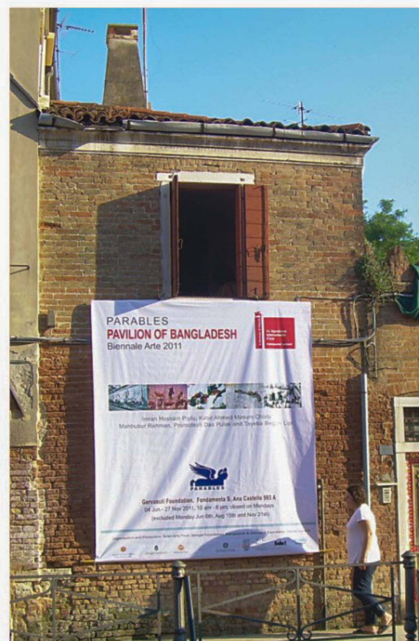
The Bangladesh pavilion in Venice.