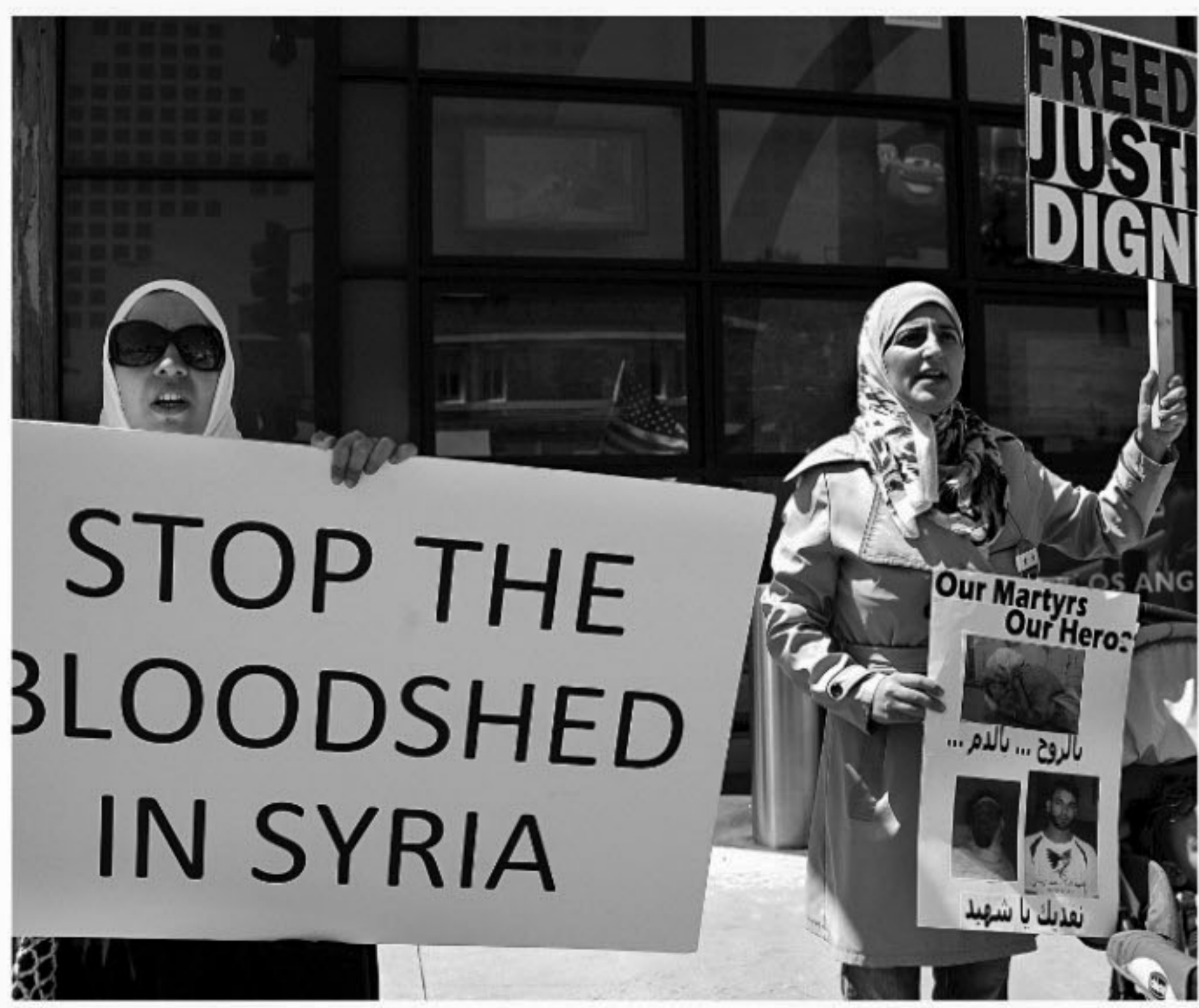
People attend a demonstration to ask for freedom in Syria on Saturday in front of the CNN building in Hollywood, California.