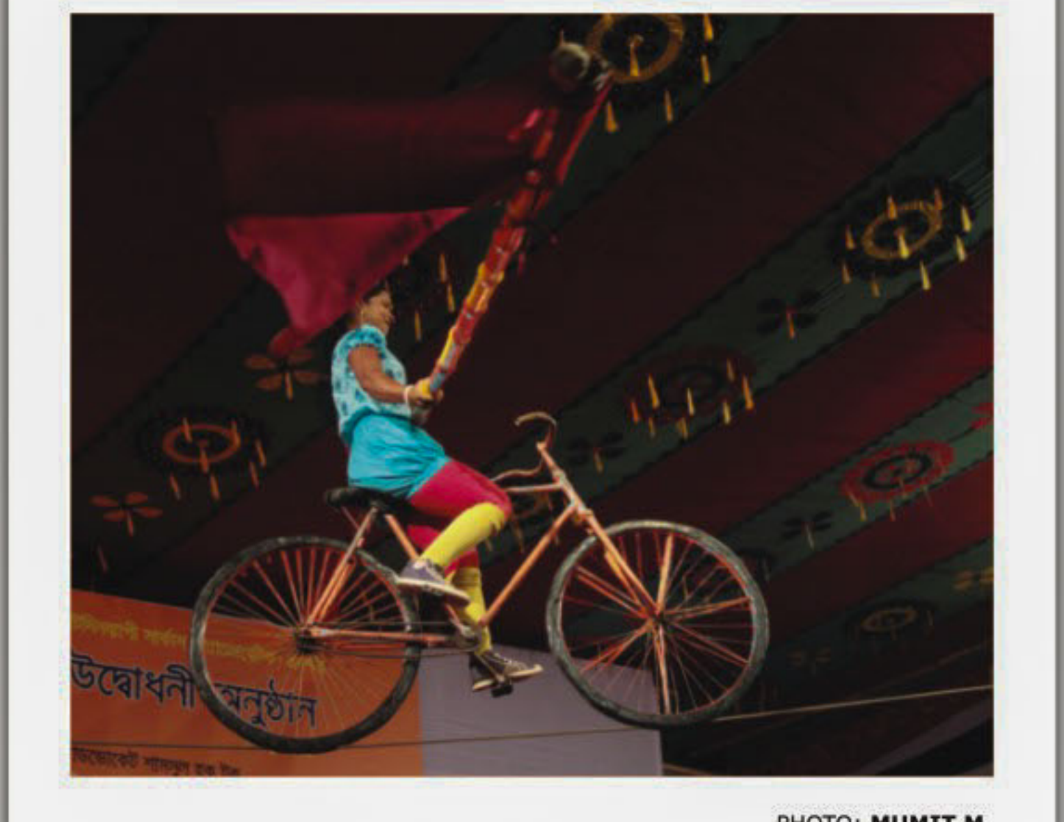
Bangladesh Shilpakala Academy is holding an eight-day long Circus Festival at its premises. Opening on June 1, the festival features acrobatics and performances by The Lion and Rowshan Circus troupes.