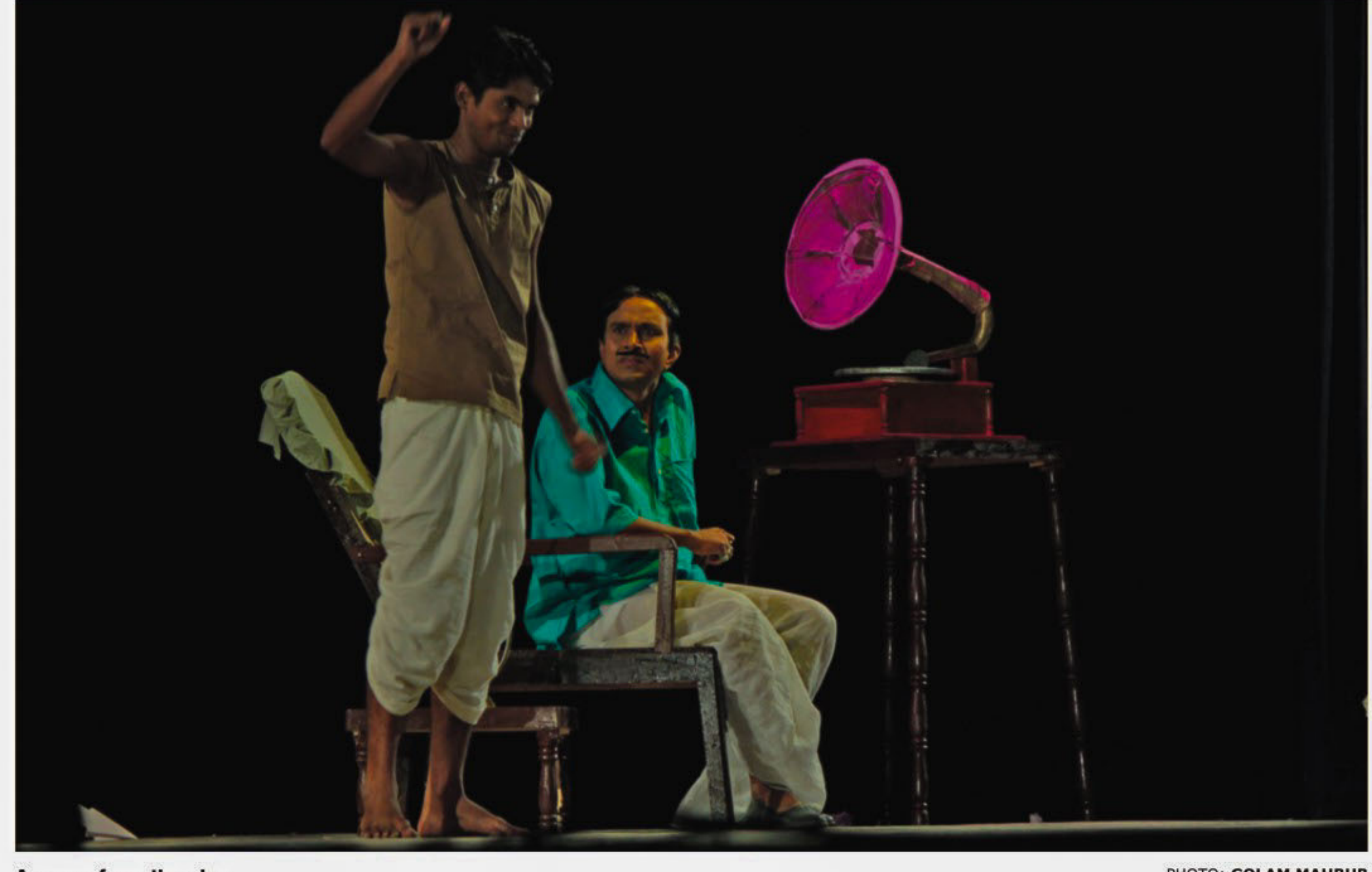
A scene from the play.