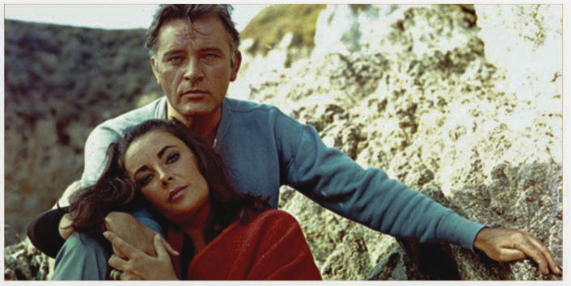
The tempestuous romance between Elizabeth Taylor and Richard Burton is to be made into a film by 'Goodfellas' director Martin Scorsese. Taylor, who died earlier this year aged 79, married eight times -- twice to Burton. The film is based on a book about the couple's relationship called 'Furious Love'. Burton and Taylor met on the set of 'Cleopatra' in 1962.